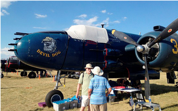
Mitchell B25 Cockpit Cover w/ Custom Imprint (Bellystrap Type) Mitchell B25 Cockpit Cover w/ Custom Imprint (Bellystrap Type)