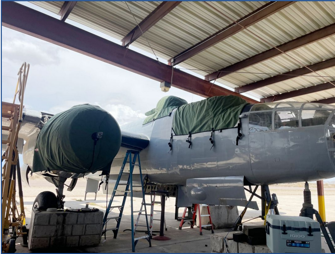
Mitchell B25 Cockpit, Turret &amp; Engine Covers