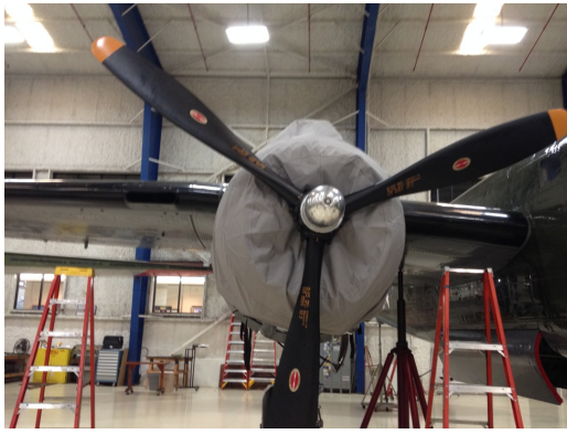
B25 Engine Cover