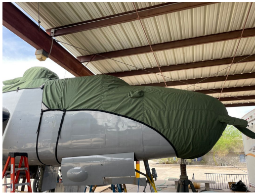
Mitchell B25 Cockpit/Nose Cover, & Turret Cover