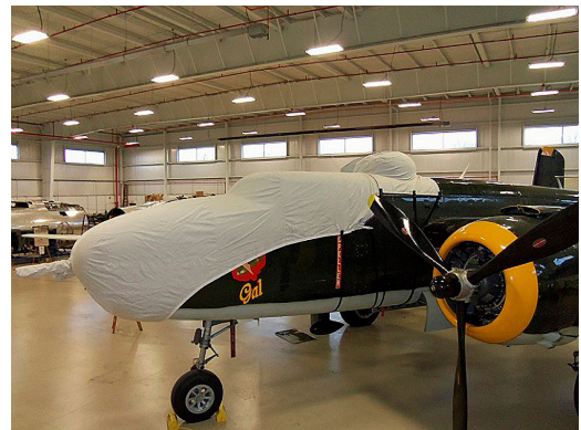
B25 Cockpit/Nose and Gun Turret Covers