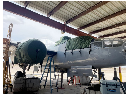
Mitchell B25 Cockpit, Turret & Engine Covers