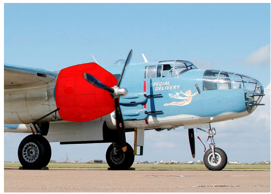
B25 Engine Cover, Illustration