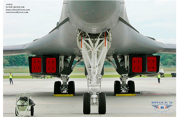
B1-B Bomber Intake Plugs