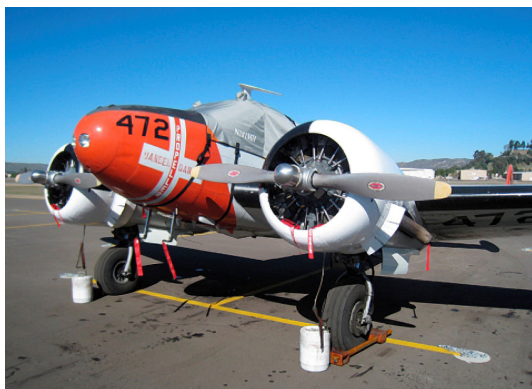
Beech 18 Cockpit Cover and Carb Air Inlet Plugs

This cover type is made from Silver Acrylic Sunbrella canvas and is 100% lined with a soft and smooth microfiber. Bruce's Custom Covers developed this material combination especially for aircraft protection. The outer material is medium weight and treated for water resistance, UV resistance and anti-static buildup. The inner lining is a very soft and smooth microfiber to prevent scratching. The material is very reflective, and tests show that the cabin interior temperature can be reduced to near-ambient temperature on the hottest of days. It is water, ice and snow repellent, yet breathable to allow moisture to escape from between the cover and the aircraft surface.