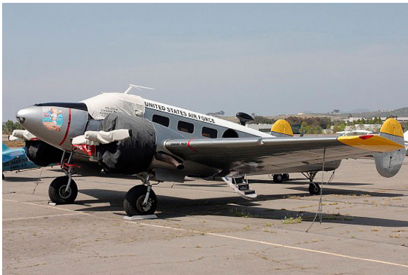
Twin Beech 18 Cockpit, Engine & Prop Covers

Travel Covers are made with Silver Solution-Dyed Polyester fabric and only lined over the windshield to save weight. The material is lightweight and more compact for easy stowage in the aircraft. The polyester material is water resistant, but only intended for occasional use outside. We also have an ultra lightweight material available for fitted hangar dust covers. For daily outdoor use, the non-travel Sunbrella Cover is the best choice.