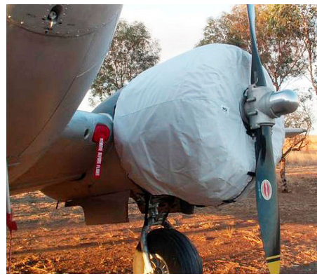
Beech D-18 Engine Covers, Center Section Oil Cooler Inlet Plugs, and Pitot Covers