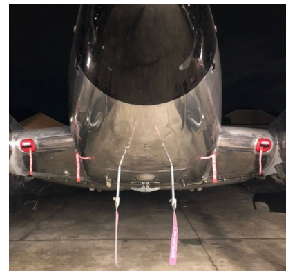
Beech 18 Oil Cooler Inlet Plugs