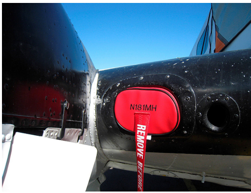
Beech 18 Oil Cooler Center Section Inlet Plugs