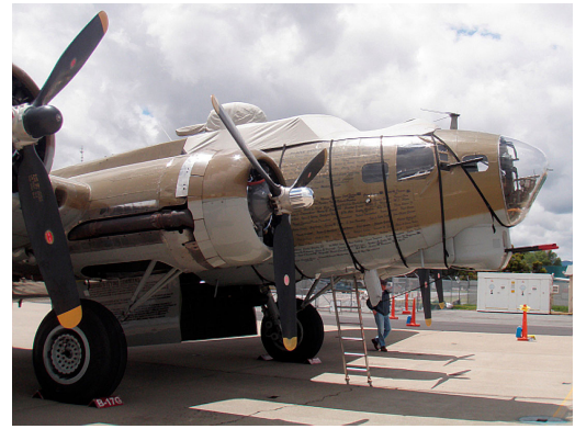
B-17 Canopy/Gun Turret Cover