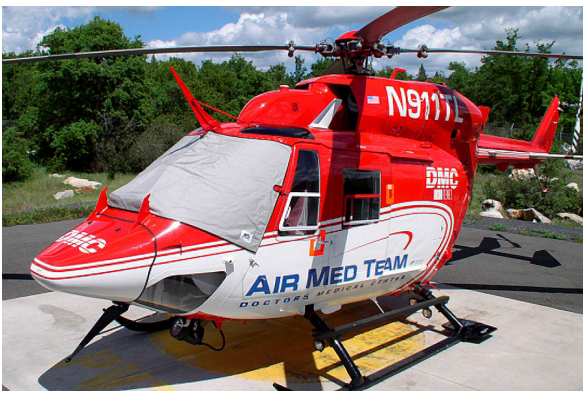
BK-117 Windshield Cover