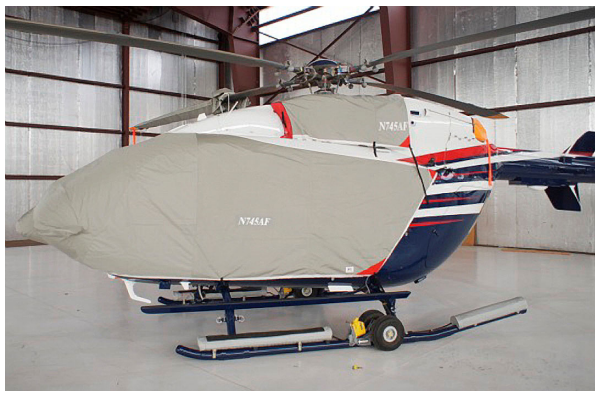
Bubble Cover w/ nose mounted radome, Upper Deck Plugs/Cover