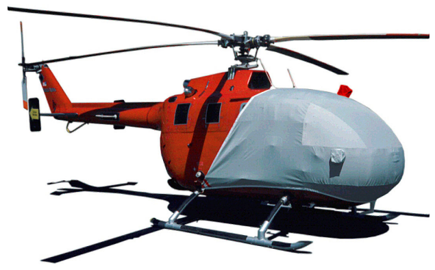
MBB BO-105 Bubble Cover