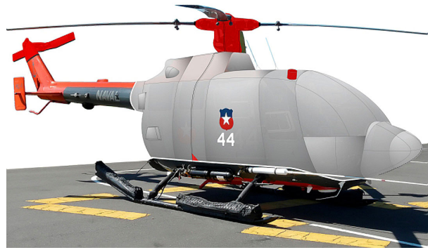
MBB BO-105 Full Body, Rotor Mast & Tail Rotor Covers (illustration)