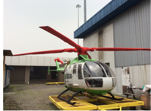
MBB BO-105 Blade, Rotor Head & Tail Rotor Covers