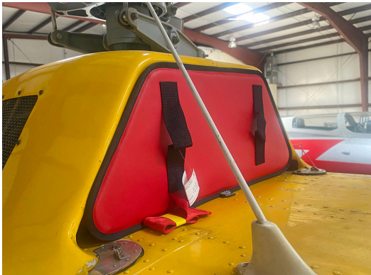
BO 105CB Intake Plug

The Engine Inlet Plugs are custom fit for your Eurocopter BO-105 intakes, made with heavy-duty vinyl material, and stuffed with a single block of sculpted urethane foam. Each plug has a zipper that allows the foam to be removed and dried if necessary. Engine plugs have 'Remove Before Flight' streamers sewn onto the face of the plugs. Most plugs are imprinted with the aircraft registration number in black for an extra charge. Storage bag NOT included. Engine plugs may be inserted after flight when the engine is still warm. Engine Inlet Plugs are commonly referred to as Cowl Plugs, Intake Plugs, Cowl Blocks, Engine Blocks, and Engine Bungs.