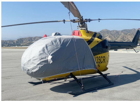
Eurocopter BO-105 Bubble Cover, Standard Model