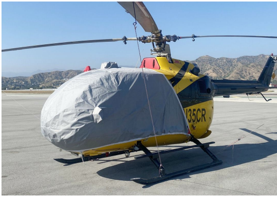
Eurocopter BO-105 Bubble Cover, Standard Model