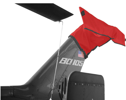
MBB BO-105 Tail Rotor/Gearbox Cover