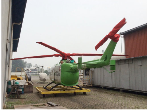
MBB BO-105 Blade, Rotor Head & Tail Rotor Covers

WINTER USE MATERIAL - Made with Solution-Dyed Polyester fabric, this option is intended for seasonal use to aid in deicing, rain mitigation, or for occasional travel. The material is lighter and more compact, but more susceptible to UV damage and may have a shorter useful life if used continuously outside than the all-year use material.