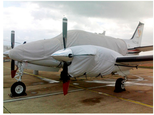
King Air C90 Canopy/Nose Cover, Engine Covers