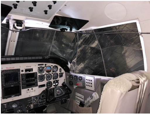
Beech King Air 90 & 100 (U-21, RU-21, T-44) Cockpit Heatshields