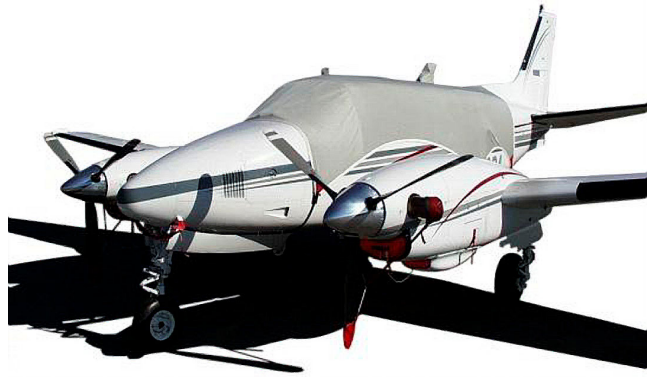
King Air Canopy Cover, Engine Plugs, Prop-Tie/Exhaust Covers