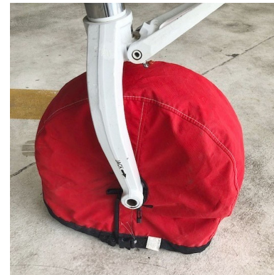
Beech King Air 300 Tire Covers (nose gear)