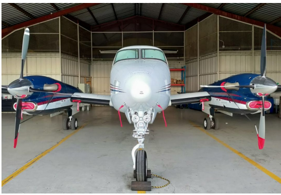
Beech King Air Prop Tie-Downs/Exhaust Covers