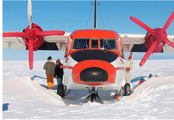
Casa 212 Insulated Engine & Propellor/Spinner Covers