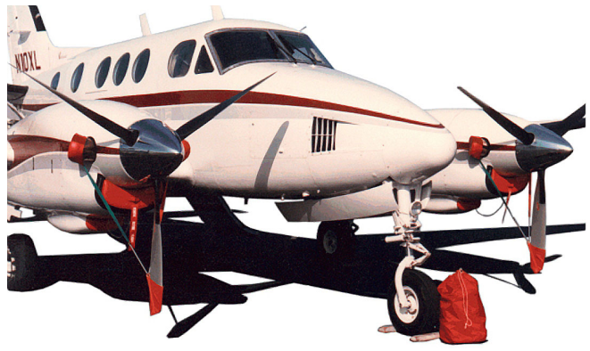
Pitot, Exhaust Covers, Engine Plugs & Prop Ties