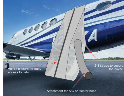
King Air Airstair Coor Cover