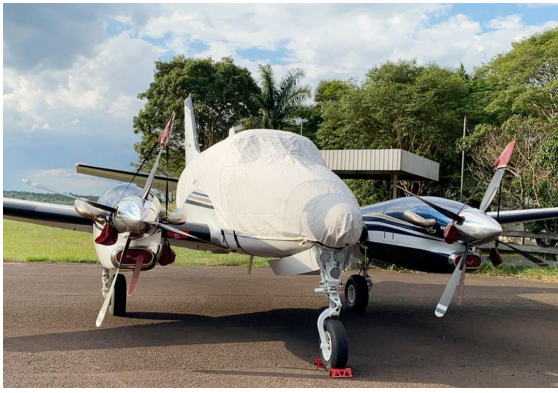
King Air C90GTi Canopy/Nose Cover