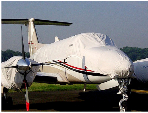
King Air 350 Canopy/Nose Cover, Engine Covers