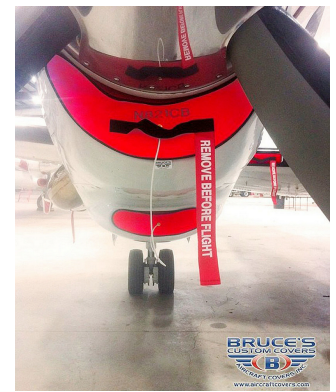
ENGINE PLUGS PREVENT BIRD NEST FOD. Piper Saratoga Engine Cowling Bird's Nest Engine and Oil Cooler Inlet Plugs