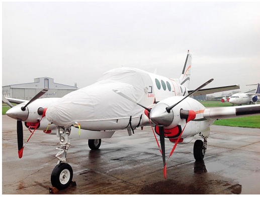
King Air Cockpit/Nose Cover, Plugs, Prop Tie/Exhaust Covers