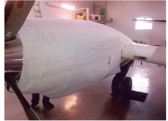
King Air B100 Engine Cover, test fit cover