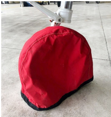
Beech King Air 300 Tire Covers (nose gear)

ALL-YEAR USE MATERIAL - Made with Silver Acrylic Sunbrella canvas, the all-year use material is the best option for sun protection and cover longevity. This heavier more durable material is intended for all weather conditions, such as rain and snow or lots of sun.