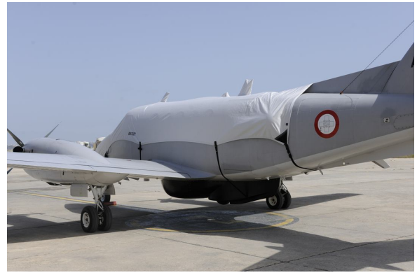
King Air 200 Canopy/Nose Cover