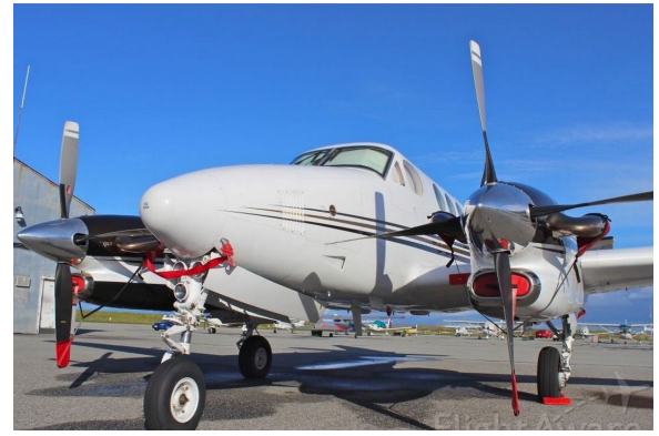
King Air C90A Engine Plugs and Pitot Covers