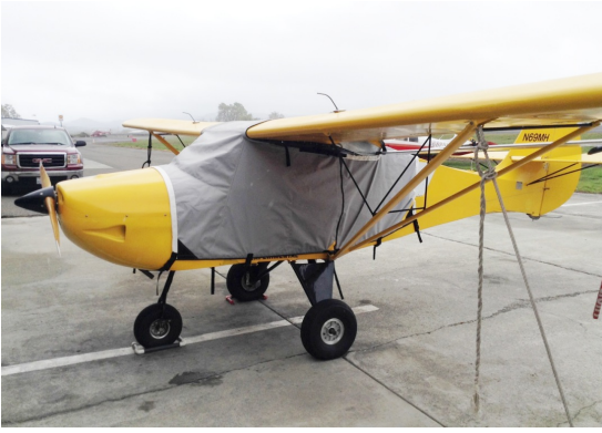
Avid Flyer Extended Canopy Cover