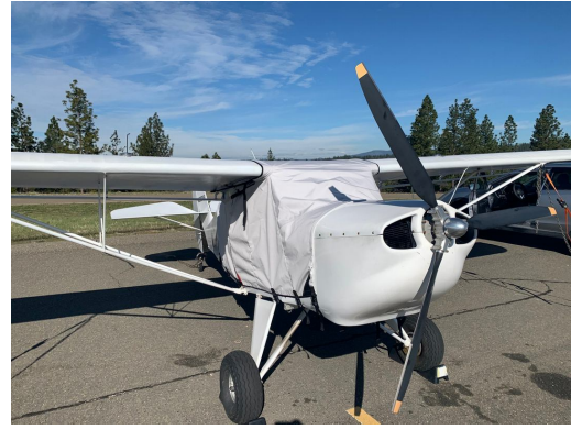
Avid Heavy Hauler MK 4 Over The Top Style Canopy Cover