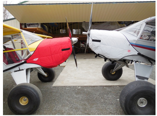
Avid Insulated Engine Covers