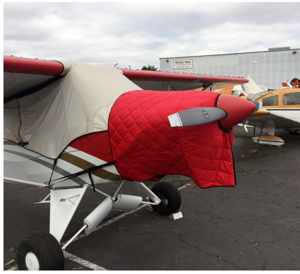
FOR INTERIOR USE. Cub Crafters CC-11 Insulated Hangar Blanket, available in Red or Silver