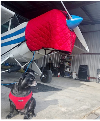
Piper PA-12 Insulated Hangar Blanket