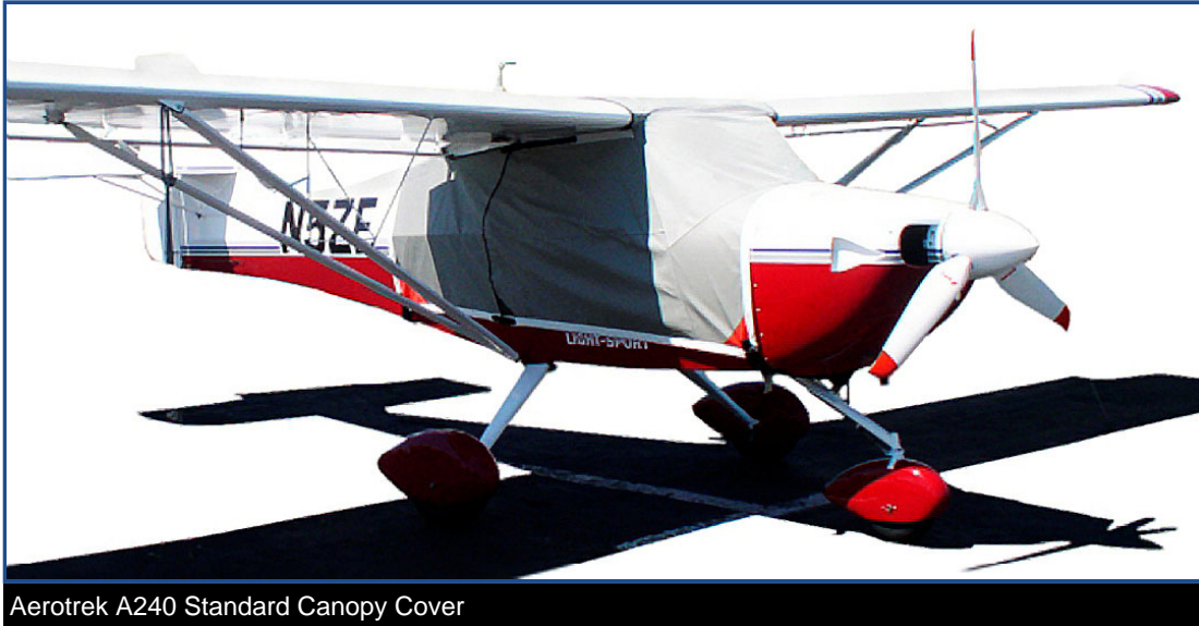
Aerotrek A240 Standard Canopy Cover