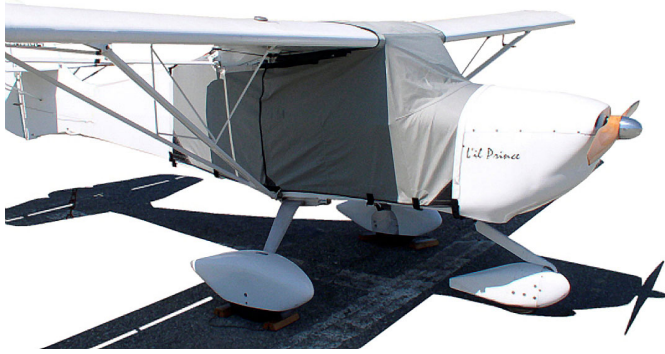
Avid Flyer Extended Canopy Cover