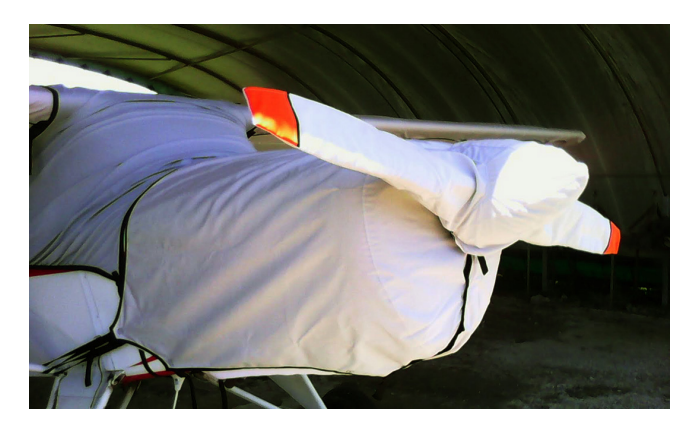
Auster J5 Canopy, Engine, and Propellor Covers