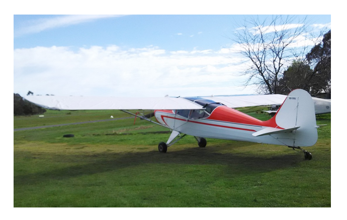
Auster J5 Autocar Wing Covers