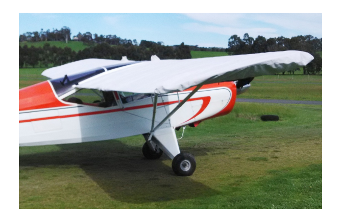
Auster J5 Autocar Wing Covers

WINTER USE MATERIAL - Made with Solution-Dyed Polyester fabric, this option is intended for seasonal use to aid in deicing, rain mitigation, or for occasional travel. The material is lighter and more compact, but more susceptible to UV damage and may have a shorter useful life if used continuously outside than the all-year use material.