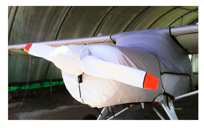
Auster J5 Canopy, Engine, and Propellor Covers