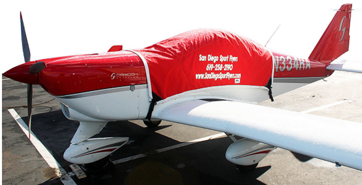
Gobosh Canopy Cover with custom Imprint

This cover type is made from Silver Acrylic Sunbrella canvas and is 100% lined with a soft and smooth microfiber. Bruce's Custom Covers developed this material combination especially for aircraft protection. The outer material is medium weight and treated for water resistance, UV resistance and anti-static buildup. The inner lining is a very soft and smooth microfiber to prevent scratching. The material is very reflective, and tests show that the cabin interior temperature can be reduced to near-ambient temperature on the hottest of days. It is water, ice and snow repellent, yet breathable to allow moisture to escape from between the cover and the aircraft surface.