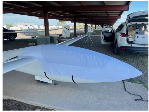
Schleicher ASW-19 Canopy/Nose Cover, test fit cover