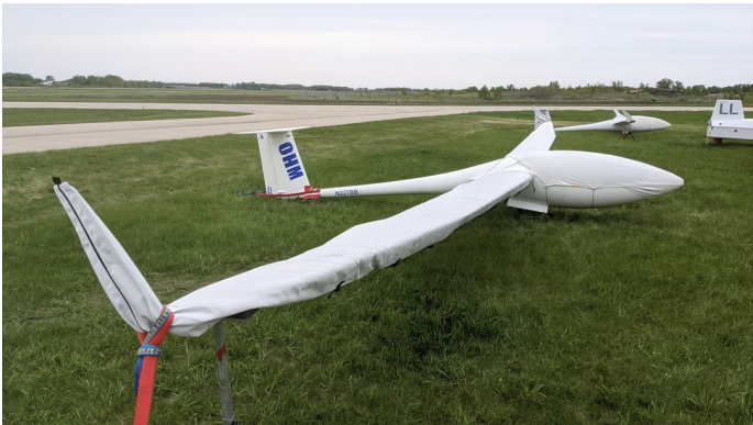
Schleicher ASW-27 Wing Covers