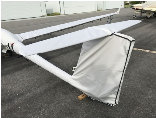
Schleicher ASW-27b Empennage & Wing Covers

WINTER USE MATERIAL - Made with Solution-Dyed Polyester fabric, this option is intended for seasonal use to aid in deicing, rain mitigation, or for occasional travel. The material is lighter and more compact, but more susceptible to UV damage and may have a shorter useful life if used continuously outside than the all-year use material.