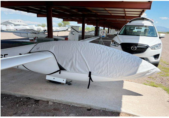
Schleicher ASW-19 Canopy/Nose Cover