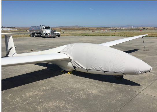
Schleicher ASK-21 Canopy/Nose Cover

This cover type is made from Silver Acrylic Sunbrella canvas and is 100% lined with a soft and smooth microfiber. Bruce's Custom Covers developed this material combination especially for aircraft protection. The outer material is medium weight and treated for water resistance, UV resistance and anti-static buildup. The inner lining is a very soft and smooth microfiber to prevent scratching. The material is very reflective, and tests show that the cabin interior temperature can be reduced to near-ambient temperature on the hottest of days. It is water, ice and snow repellent, yet breathable to allow moisture to escape from between the cover and the aircraft surface.