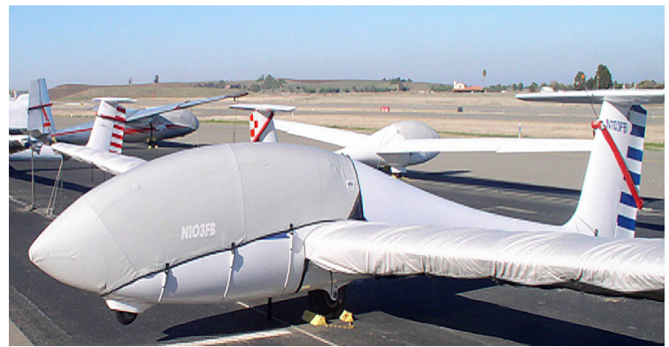
Grob 103 Canopy/Nose Cover and Wing Covers