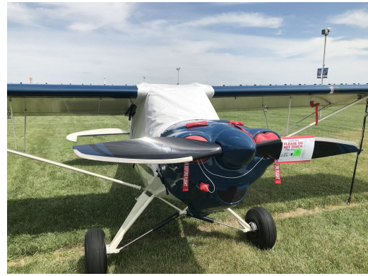
Cub Crafters EX2 Canopy Cover, Engine Plugs