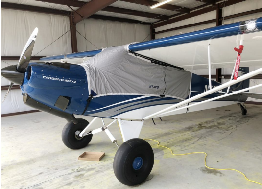
Cub Crafters Carbon Cub Travel Weight Canopy Cover

Travel Covers are made with Silver Solution-Dyed Polyester fabric and only lined over the windshield to save weight. The material is lightweight and more compact for easy stowage in the aircraft. The polyester material is water resistant, but only intended for occasional use outside. We also have an ultra lightweight material available for fitted hangar dust covers. For daily outdoor use, the non-travel Sunbrella Cover is the best choice.