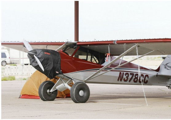
Cub Crafters CC11-160 Insulated Engine Cover