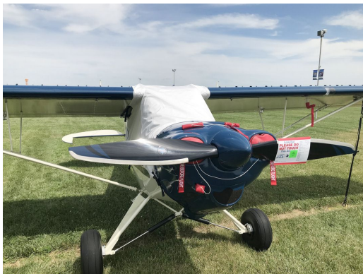
Cub Crafters EX2 Canopy Cover, Engine Plugs

Engine Inlet Plugs are custom fit for your Lewaero Ascender intakes, made with heavy-duty vinyl material, and stuffed with a single block of sculpted urethane foam. Each plug has a zipper that allows the foam to be removed and dried if necessary. Engine plugs have warning flags that are visible from the cockpit or 'remove before flight' streamers sewn onto the face of the plugs. Most plugs are imprinted with the aircraft registration number in black for an extra charge. Storage bag NOT included. Engine plugs may be inserted after flight when the engine is still warm. Engine Inlet Plugs are commonly referred to as Cowl Plugs, Intake Plugs, Cowl Blocks, Engine Blocks, and Engine Bungs.