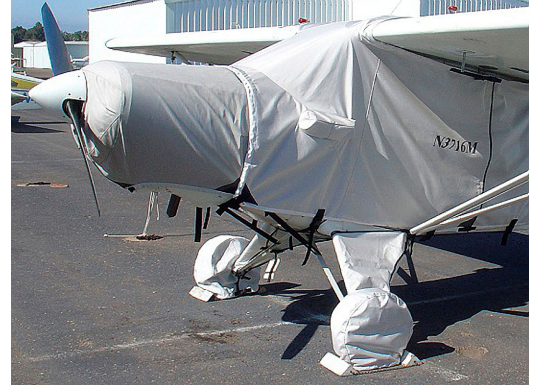
Piper PA-12 Landing Gear Covers