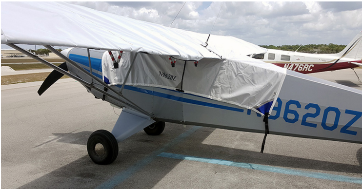
Aviat (Christen) Husky Wing Covers, All Year Use

WINTER USE MATERIAL - Made with Solution-Dyed Polyester fabric, this option is intended for seasonal use to aid in deicing, rain mitigation, or for occasional travel. The material is lighter and more compact, but more susceptible to UV damage and may have a shorter useful life if used continuously outside than the all-year use material.