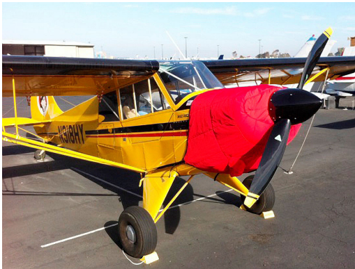
Aviat Husky Insulated Engine Cover

This cover type is made from Silver Acrylic Sunbrella canvas and is 100% lined with a soft and smooth microfiber. Bruce's Custom Covers developed this material combination especially for aircraft protection. The outer material is medium weight and treated for water resistance, UV resistance and anti-static buildup. The inner lining is a very soft and smooth microfiber to prevent scratching. The material is very reflective, and tests show that the cabin interior temperature can be reduced to near-ambient temperature on the hottest of days. It is water, ice and snow repellent, yet breathable to allow moisture to escape from between the cover and the aircraft surface.