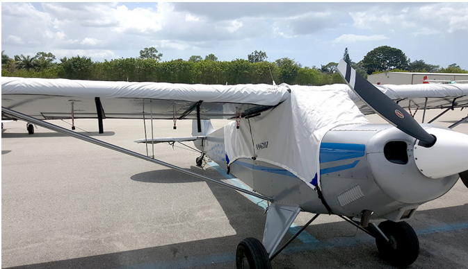
Aviat (Christen) Husky Canopy Cover (Over-The-Top Style)