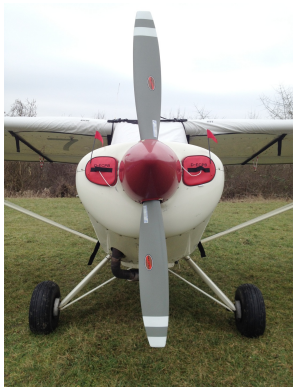
Aviat Husky Engine Plugs, Wing Covers

Engine Inlet Plugs are custom fit for your Normand Dube Aerocruiser intakes, made with heavy-duty vinyl material, and stuffed with a single block of sculpted urethane foam. Each plug has a zipper that allows the foam to be removed and dried if necessary. Engine plugs have warning flags that are visible from the cockpit or 'remove before flight' streamers sewn onto the face of the plugs. Most plugs are imprinted with the aircraft registration number in black for an extra charge. Storage bag NOT included. Engine plugs may be inserted after flight when the engine is still warm. Engine Inlet Plugs are commonly referred to as Cowl Plugs, Intake Plugs, Cowl Blocks, Engine Blocks, and Engine Bungs.