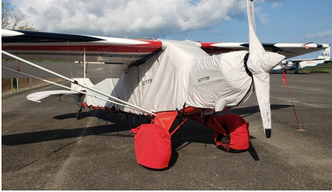
Aviat Husky Extended Canopy Cover, Engine, Prop, Empennage & Tire Covers

ALL-YEAR USE MATERIAL - Made with Silver Acrylic Sunbrella canvas, the all-year use material is the best option for sun protection and cover longevity. This heavier more durable material is intended for all weather conditions, such as rain and snow or lots of sun.