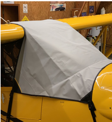
Cub Crafters Carbon Cub FX3 Windshield/Skylight Cover, travel weight

This cover type is made from Silver Acrylic Sunbrella canvas and is 100% lined with a soft and smooth microfiber. Bruce's Custom Covers developed this material combination especially for aircraft protection. The outer material is medium weight and treated for water resistance, UV resistance and anti-static buildup. The inner lining is a very soft and smooth microfiber to prevent scratching. The material is very reflective, and tests show that the cabin interior temperature can be reduced to near-ambient temperature on the hottest of days. It is water, ice and snow repellent, yet breathable to allow moisture to escape from between the cover and the aircraft surface.