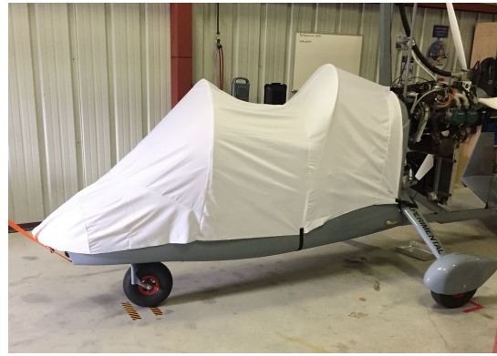
Magni M16 Autogyro Canopy/Nose Cover, test fit cover