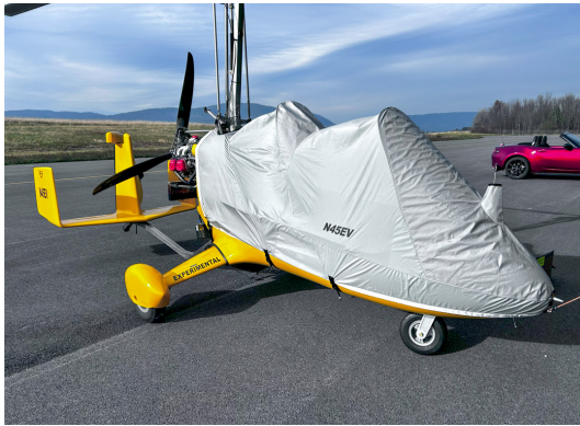
AR1 American Ranger Gyrocopter Travel Cover, Lightweight Canopy/Nose Cover

Travel Covers are made with Silver Solution-Dyed Polyester fabric and fully lined over the entire cover. The material is lightweight and more compact for easy storage in the aircraft. The polyester material is water resistant, but only intended for occasional use outside. We also have an ultra lightweight material available for fitted hangar dust covers. For daily outdoor use, the non-travel Sunbrella Cover is the best choice.