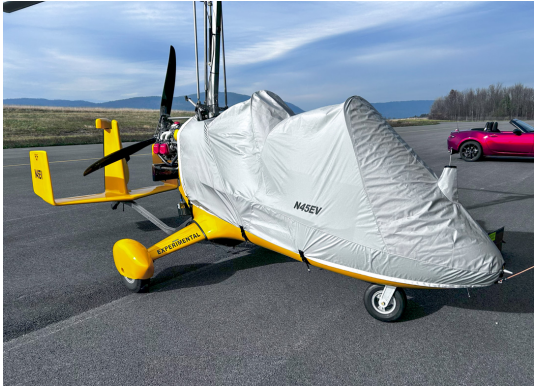
AR1 American Ranger Gyrocopter Travel Cover, Lightweight Canopy/Nose Cover