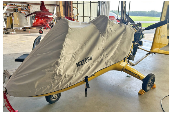
American Ranger AR-1 Gyrocopter Canopy/Nose Cover