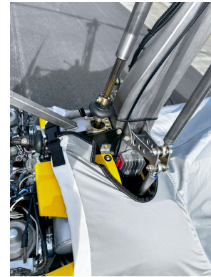
AR1 American Ranger Gyrocopter Travel Cover, Lightweight Canopy/Nose Cover