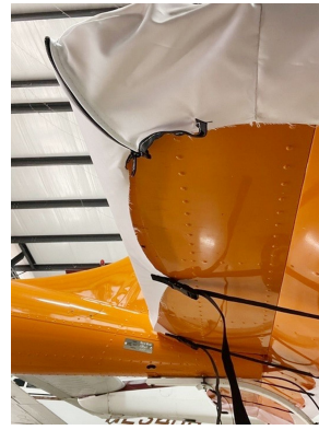
Aeromarine Merlin Horizontal Stabilizer Covers, test fit covers