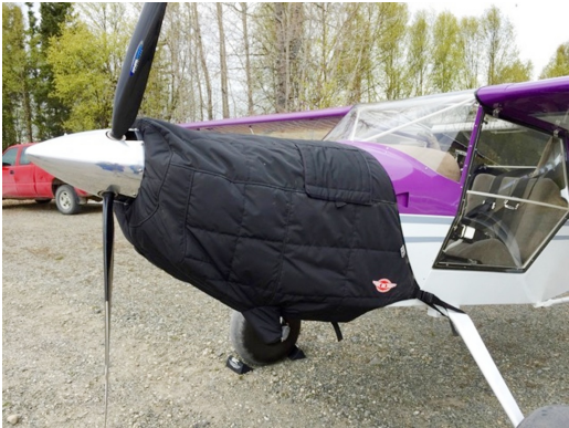
Kitfox Insulated Engine Cover

This cover type is made from Silver Acrylic Sunbrella canvas and is 100% lined with a soft and smooth microfiber. Bruce's Custom Covers developed this material combination especially for aircraft protection. The outer material is medium weight and treated for water resistance, UV resistance and anti-static buildup. The inner lining is a very soft and smooth microfiber to prevent scratching. The material is very reflective, and tests show that the cabin interior temperature can be reduced to near-ambient temperature on the hottest of days. It is water, ice and snow repellent, yet breathable to allow moisture to escape from between the cover and the aircraft surface.