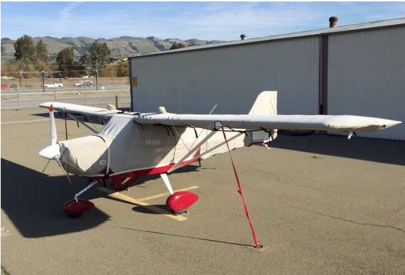
Eurofox Canopy, Engine, Wings and Empennage Covers