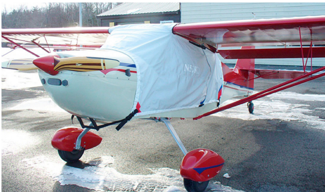
Kitfox IV Over-the-top Canopy Cover