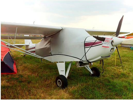
Kitfox Spandex FlyAway Travel Canopy Cover

Travel Covers are made with Silver Solution-Dyed Polyester fabric and only lined over the windshield to save weight. The material is lightweight and more compact for easy stowage in the aircraft. The polyester material is water resistant, but only intended for occasional use outside. We also have an ultra lightweight material available for fitted hangar dust covers. For daily outdoor use, the non-travel Sunbrella Cover is the best choice.