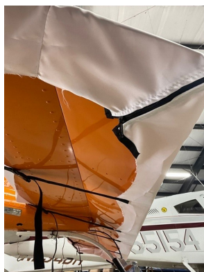
Aeromarine Merlin Horizontal Stabilizer Covers, test fit covers