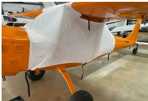
Aeromarine Merlin Over-Top Canopy Cover, test fit cover