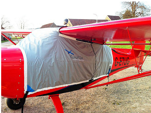
EuroFox and Aerotrek A240 Lightweight Travel Canopy Cover

This cover type is made from Silver Acrylic Sunbrella canvas and is 100% lined with a soft and smooth microfiber. Bruce's Custom Covers developed this material combination especially for aircraft protection. The outer material is medium weight and treated for water resistance, UV resistance and anti-static buildup. The inner lining is a very soft and smooth microfiber to prevent scratching. The material is very reflective, and tests show that the cabin interior temperature can be reduced to near-ambient temperature on the hottest of days. It is water, ice and snow repellent, yet breathable to allow moisture to escape from between the cover and the aircraft surface.