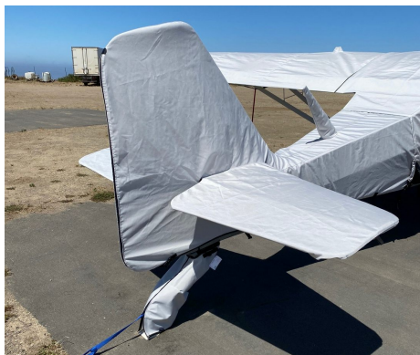
Kitfox Full Cover Set

ALL-YEAR USE MATERIAL - Made with Silver Acrylic Sunbrella canvas, the all-year use material is the best option for sun protection and cover longevity. This heavier more durable material is intended for all weather conditions, such as rain and snow or lots of sun.