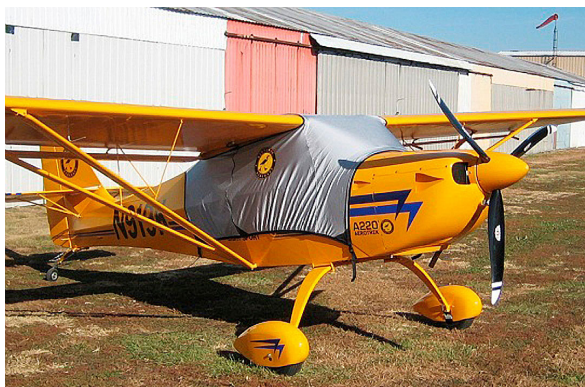
Aerotrek A220 Fitted Hangar Dust Cover

Travel Covers are made with Silver Solution-Dyed Polyester fabric and only lined over the windshield to save weight. The material is lightweight and more compact for easy stowage in the aircraft. The polyester material is water resistant, but only intended for occasional use outside. We also have an ultra lightweight material available for fitted hangar dust covers. For daily outdoor use, the non-travel Sunbrella Cover is the best choice.