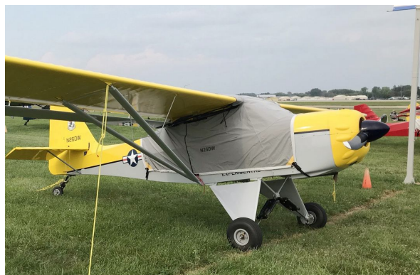
Kitfox Travel Canopy Cover