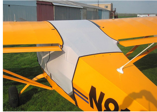
Aerotrek A240 Spandex FlyAway Travel Canopy Cover