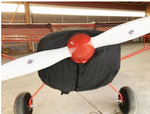
Kitfox Insulated Engine Cover

This cover type is made from Silver Acrylic Sunbrella canvas and is 100% lined with a soft and smooth microfiber. Bruce's Custom Covers developed this material combination especially for aircraft protection. The outer material is medium weight and treated for water resistance, UV resistance and anti-static buildup. The inner lining is a very soft and smooth microfiber to prevent scratching. The material is very reflective, and tests show that the cabin interior temperature can be reduced to near-ambient temperature on the hottest of days. It is water, ice and snow repellent, yet breathable to allow moisture to escape from between the cover and the aircraft surface.