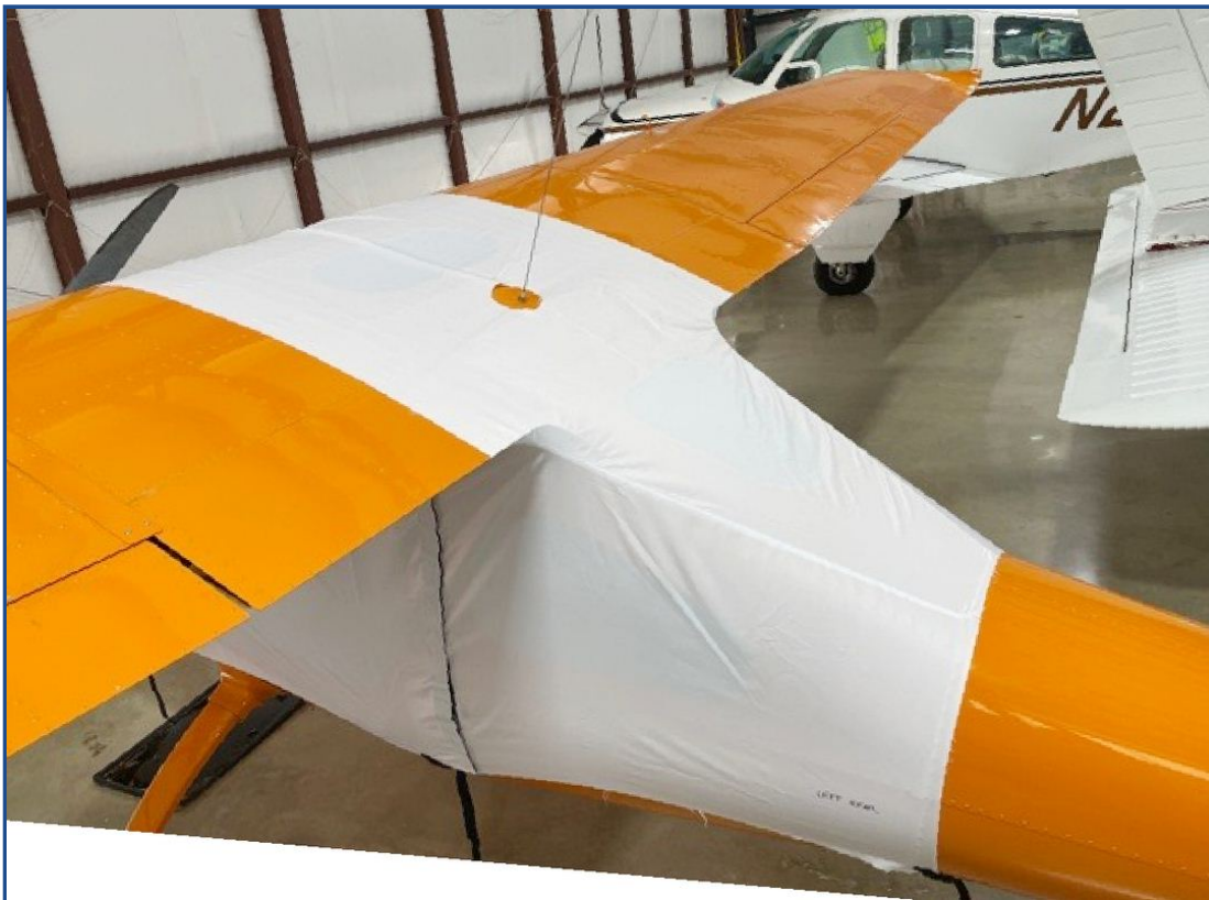
Aeromarine Merlin Over-Top Canopy Cover, test fit cover