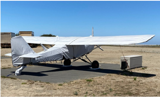
Kitfox Full Cover Set