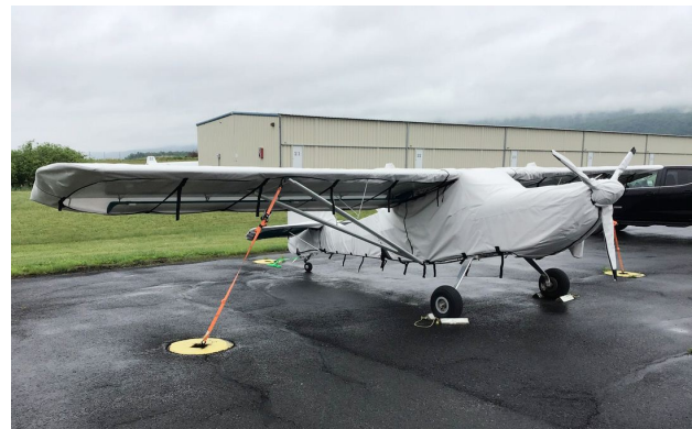
Kitfox 5 Complete Cover Set