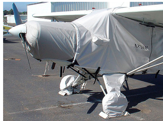
Piper PA-12 Landing Gear Covers