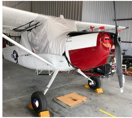
Cessna Bird Dog, L-19, O-1, 305 Canopy Cover, Over-Top Type