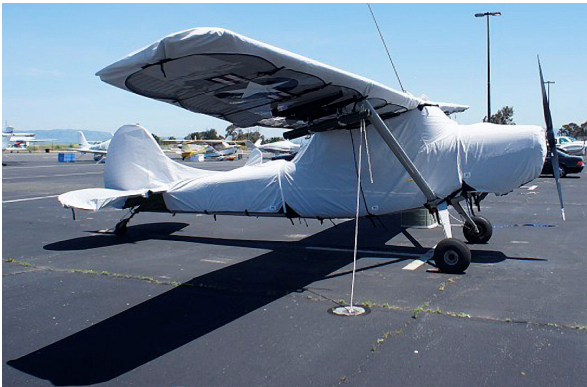
Wing Covers on Cessna Bird Dog