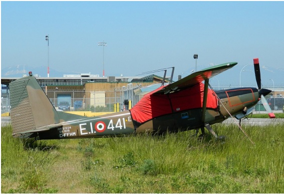
Cessna L-19 Bird Dog Canopy Cover

the hottest of days. It is water, ice and snow repellent, yet breathable to allow moisture to escape from between the cover and the aircraft surface.