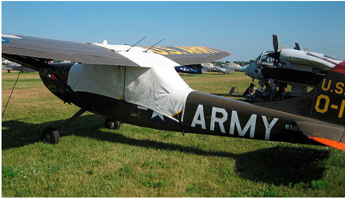
L-19 Canopy Cover