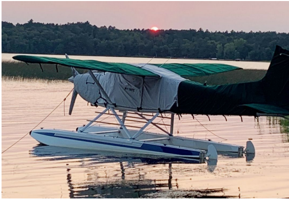
Cessna A185F Complete Cover Set

the hottest of days. It is water, ice and snow repellent, yet breathable to allow moisture to escape from between the cover and the aircraft surface.