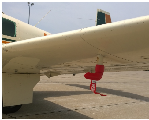
Mooney Pitot Cover