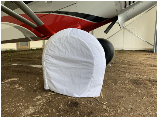
Cub Crafters CC19 Oversize Tire Covers, test fit cover

ALL-YEAR USE MATERIAL - Made with Silver Acrylic Sunbrella canvas, the all-year use material is the best option for sun protection and cover longevity. This heavier more durable material is intended for all weather conditions, such as rain and snow or lots of sun.