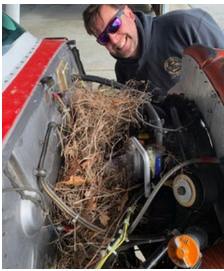
Cessna 172 Bird Nest Problem