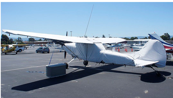
Cessna L-19 Extended Over-the-top Canopy, Engine, Empennage & Wing Covers