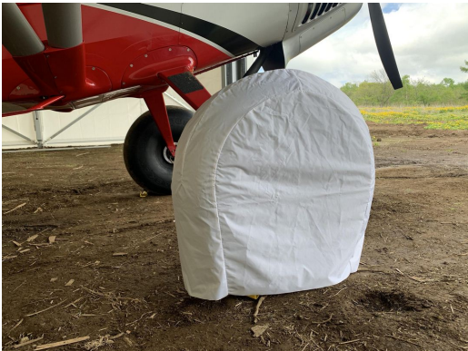
Cub Crafters CC19 Oversize Tire Covers, test fit cover