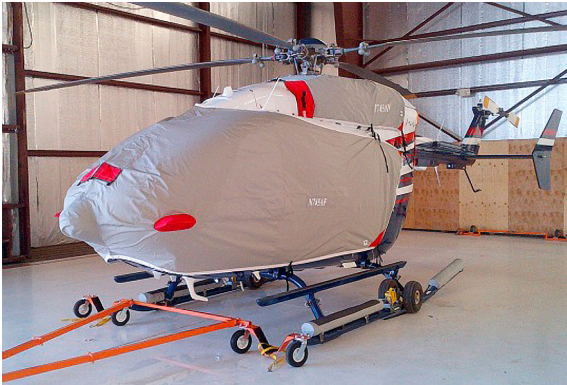
Bubble Cover w/ nose mounted radome & Upper Deck Plugs/Cover

This cover type is made from Silver Acrylic Sunbrella canvas and is 100% lined with a soft and smooth microfiber. Bruce's Custom Covers developed this material combination especially for aircraft protection. The outer material is medium weight and treated for water resistance, UV resistance and anti-static buildup. The inner lining is a very soft and smooth microfiber to prevent scratching. The material is very reflective, and tests show that the cabin interior temperature can be reduced to near-ambient temperature on the hottest of days. It is water, ice and snow repellent, yet breathable to allow moisture to escape from between the cover and the aircraft surface.