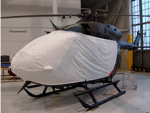
EC-145 Bubble Cover

This cover type is made from Silver Acrylic Sunbrella canvas and is 100% lined with a soft and smooth microfiber. Bruce's Custom Covers developed this material combination especially for aircraft protection. The outer material is medium weight and treated for water resistance, UV resistance and anti-static buildup. The inner lining is a very soft and smooth microfiber to prevent scratching. The material is very reflective, and tests show that the cabin interior temperature can be reduced to near-ambient temperature on the hottest of days. It is water, ice and snow repellent, yet breathable to allow moisture to escape from between the cover and the aircraft surface.