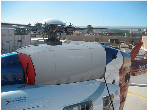
Upper Deck Plugs/Cover, extended to cover aft intake vents

The Engine Inlet Plugs are custom fit for your Airbus Helicopter UH-72A intakes, made with heavy-duty vinyl material, and stuffed with a single block of sculpted urethane foam. Each plug has a zipper that allows the foam to be removed and dried if necessary. Engine plugs have 'Remove Before Flight' streamers sewn onto the face of the plugs. Most plugs are imprinted with the aircraft registration number in black for an extra charge. Storage bag NOT included. Engine plugs may be inserted after flight when the engine is still warm. Engine Inlet Plugs are commonly referred to as Cowl Plugs, Intake Plugs, Cowl Blocks, Engine Blocks, and Engine Bungs.