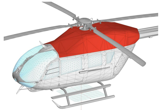
Intake/Exhaust Engine Area Cover, 3D Rendering