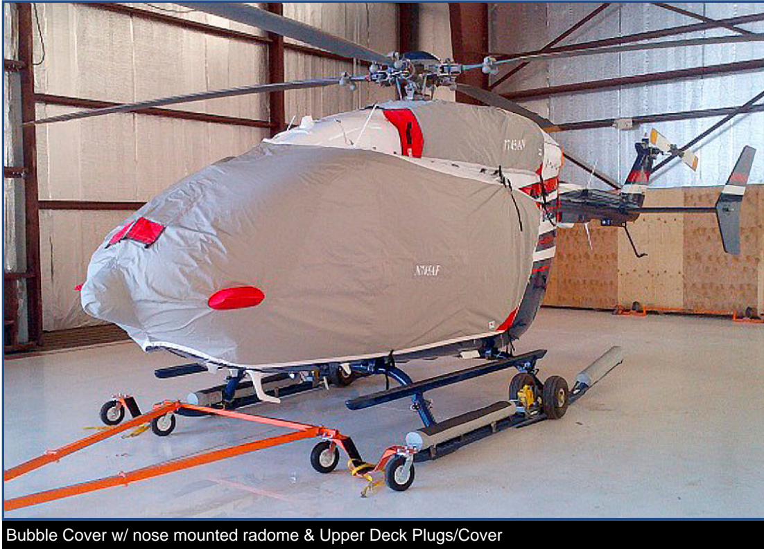
Bubble Cover w/ nose mounted radome &amp; Upper Deck Plugs/Cover