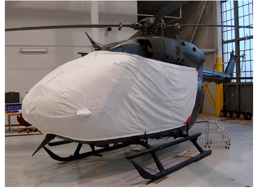
EC-145 Bubble Cover