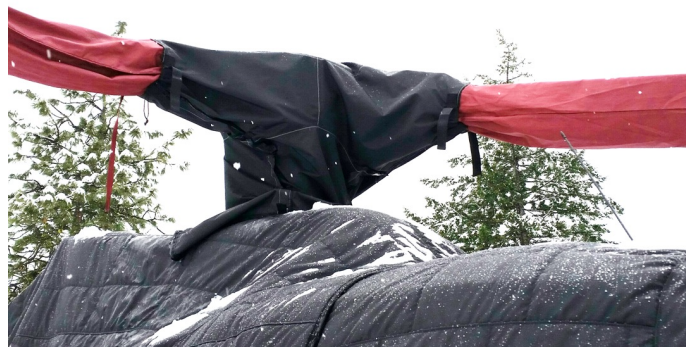
Main Rotor Hub Cover with swash plate extension.