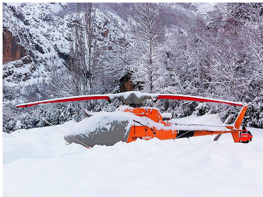
AS350 Bubble Cover, Insulated Main & Tail Rotor Covers, Blade Covers with tid-down detail

WINTER USE MATERIAL - Made with Solution-Dyed Polyester fabric, this option is intended for seasonal use to aid in deicing, rain mitigation, or for occasional travel. The material is lighter and more compact, but more susceptible to UV damage and may have a shorter useful life if used continuously outside than the all-year use material.