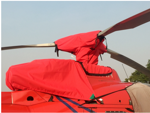
Airbus H-125 & Aerospatiale AS350 Intake/Exhaust Cover, Main Rotor Hub Cover with Weighted Skirt

WINTER USE MATERIAL - Made with Solution-Dyed Polyester fabric, this option is intended for seasonal use to aid in deicing, rain mitigation, or for occasional travel. The material is lighter and more compact, but more susceptible to UV damage and may have a shorter useful life if used continuously outside than the all-year use material.