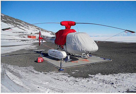
AS350 Bubble Cover w/ Cargo Mirror, Blade Tie-downs, Insulated Engine, Insulated Main Rotor Hub & Insulated Tail Rotor Covers