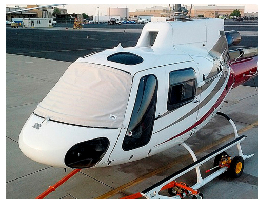
AS350 Windshield Cover, pinches in door jambs