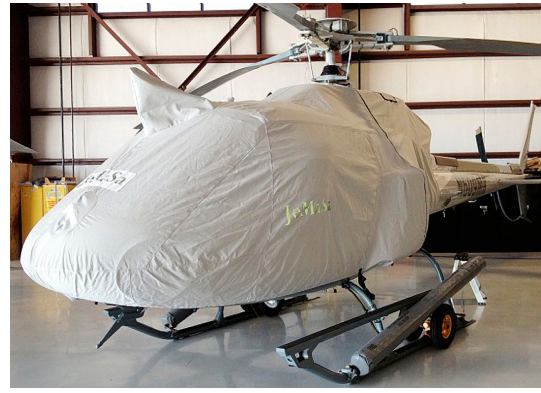
Eurocopter AS350 Main Body Cover