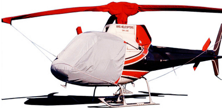
Bubble Cover, Intake/Exhaust, Rotor Mast, Tail Rotor & Main Body Covers

Travel Covers are made with Silver Solution-Dyed Polyester fabric and fully lined over the entire cover. The material is lightweight and more compact for easy stowage in the aircraft. The polyester material is water resistant, but only intended for occasional use outside. We also have an ultra lightweight material available for fitted hangar dust covers. For daily outdoor use, the non-travel Sunbrella Cover is the best choice.