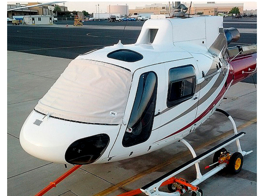
AS350 Windshield Cover, pinches in door jambs