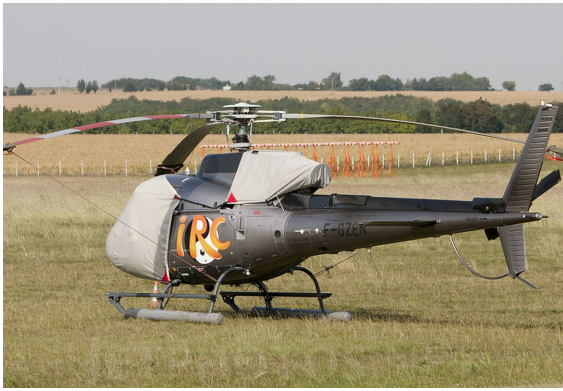
Airbus Helicopter AS350 Bubble Cover & Intake/Exhaust Cover