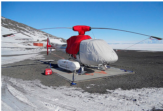
AS350 Bubble Cover w/ Cargo Mirror, Blade Tie-downs, Insulated Engine, Insulated Main Rotor Hub & Insulated Tail Rotor Covers

WINTER USE MATERIAL - Made with Solution-Dyed Polyester fabric, this option is intended for seasonal use to aid in deicing, rain mitigation, or for occasional travel. The material is lighter and more compact, but more susceptible to UV damage and may have a shorter useful life if used continuously outside than the all-year use material.