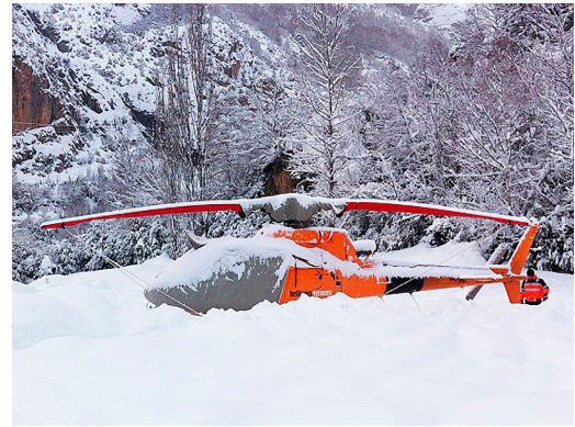
AS350 Bubble Cover, Insulated Main & Tail Rotor Covers, Blade Covers with tid-down detail