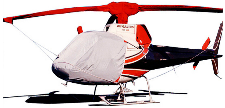
Bubble Cover, Intake/Exhaust, Rotor Mast, Tail Rotor & Main Body Covers