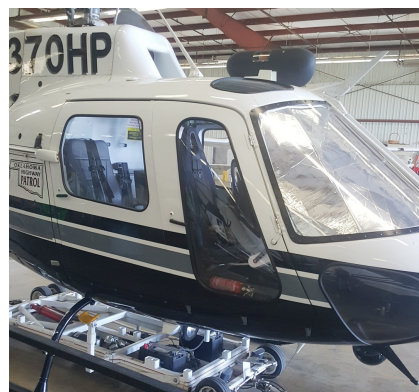
Aerospatiale AS350 Astar, Ecureuil, Esquilo, Fennec Windshield Heatshields