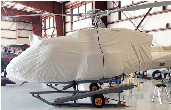
Eurocopter AS350 Main Body Cover