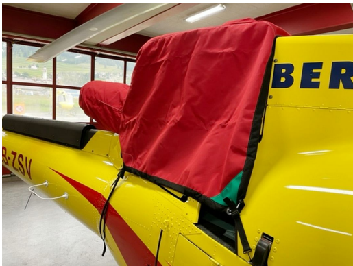
Airbus Helicopter H-125 & AS350 Intake/Exhaust Cover (newer design)