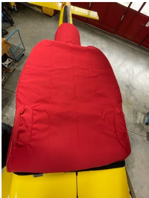
Airbus Helicopter H-125 & AS350 Intake/Exhaust Cover (newer design)

WINTER USE MATERIAL - Made with Solution-Dyed Polyester fabric, this option is intended for seasonal use to aid in deicing, rain mitigation, or for occasional travel. The material is lighter and more compact, but more susceptible to UV damage and may have a shorter useful life if used continuously outside than the all-year use material.