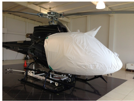
AS350 Bubble Cover