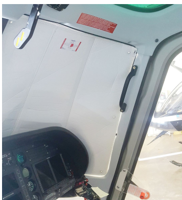
Aerospatiale AS350 Astar, Ecureuil, Esquilo, Fennec Windshield Heatshields