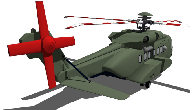
Sikorsky S-92 Tail Rotor Blade and Hub Covers