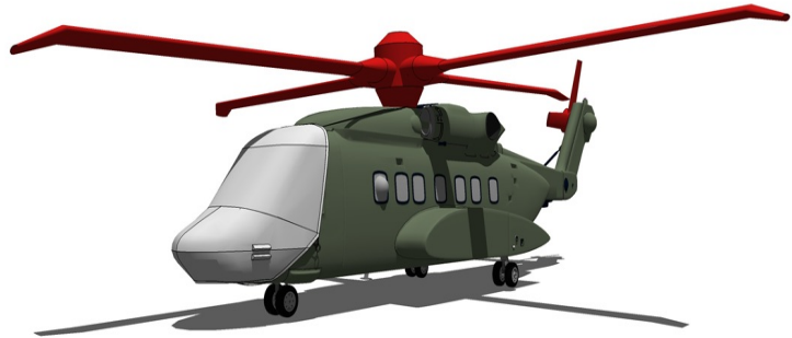
Sikorsky S-92 Windshield/Nose, Blade, Rotor Hub & Tail Rotor Covers