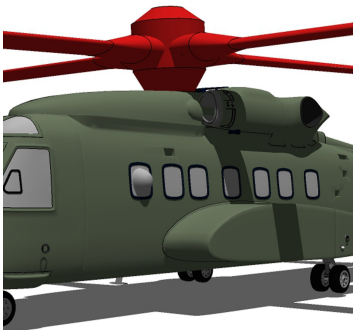
Sikorsky S-92 Main Rotor Hub Cover