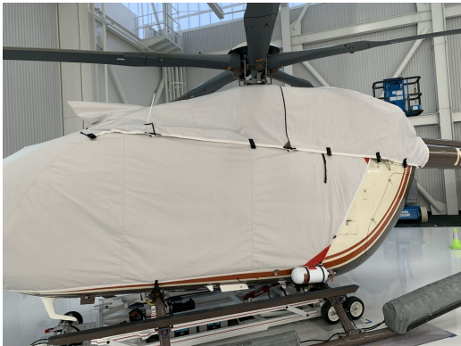
Eurocopter 145 Engine Area Cover, Bubble Cover