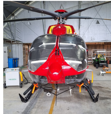
Airbus Helicopter H145D3 Windshield Heatshields, Engine Plugs