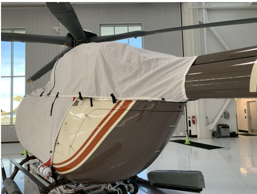
Eurocopter 145 Engine Area Cover, Bubble Cover