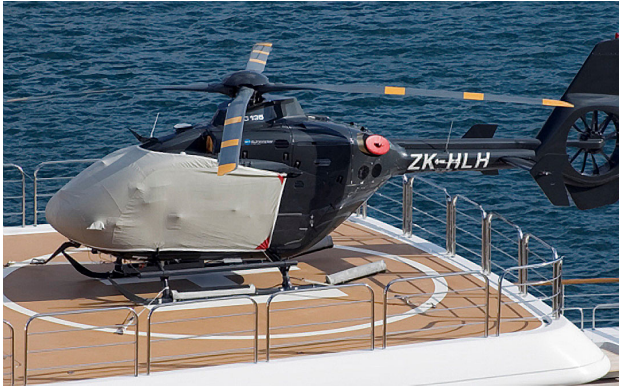
EC-135 Bubble Cover & Exhaust Plugs