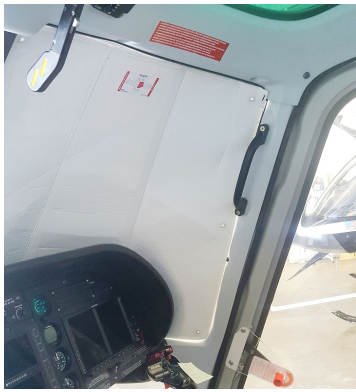
Aerospaiale AS350 Astar, Ecureuil, Esquilo, Fennec Windshield Heatshields

Heatshields are interior sunshades for an aircraft's windows or canopy glass. The product is a unique composite of closed-cell foam with a silver mylar finish. The semi-rigid design is stiff enough to stand along the inside of the windshield using sun visors or window framing. It folds up flat and easily stores in the included storage sleeve. Some designs may require velcro and suction cups. A Heatshield is an excellent short-term remedy for cockpit overheating.