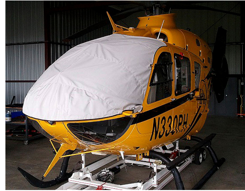
EC-135 Windshield/Skylights Cover, pinches in door jambs