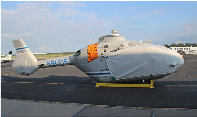
Eurocopter EC-135 Bubble & Tailfan Covers

The Tailboom Cover details vary by model, but generally the helicopter tail boom cover encloses the tail boom from the "bottleneck" to the aft end. They usually also cover the horizontal stabilizers, and are custom made to allow for antennae, lights, and other protrusions. They attach with straps underneath the tail boom. Covers for the vertical and horizontal stabilizers are also available separately. Specific information for each model is available on request.