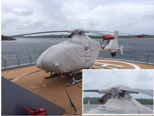
Airbus Helicopter AH135 Main Rotor Hub Cover

The Airbus Helicopter EC-135 Intake Cover . Details vary by model, but generally helicopter intake covers are designed to enclose the intake are only. They are smaller than helicopter engine covers, and their attachment details can vary from straps, to snaps, or some combination of the two. Specific information for each model is available on request.