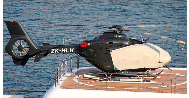
EC-135 Bubble Cover & Exhaust Plugs