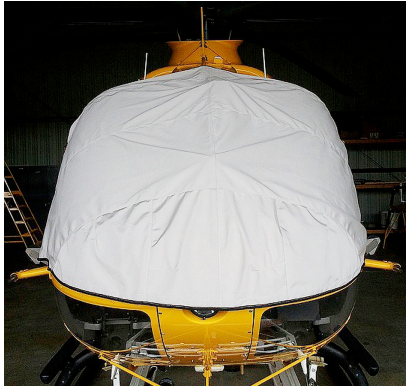
EC-135 Windshield/Skylights Cover, pinches in door jambs

This cover type is made from Silver Acrylic Sunbrella canvas and is 100% lined with a soft and smooth microfiber. Bruce's Custom Covers developed this material combination especially for aircraft protection. The outer material is medium weight and treated for water resistance, UV resistance and anti-static buildup. The inner lining is a very soft and smooth microfiber to prevent scratching. The material is very reflective, and tests show that the cabin interior temperature can be reduced to near-ambient temperature on the hottest of days. It is water, ice and snow repellent, yet breathable to allow moisture to escape from between the cover and the aircraft surface.