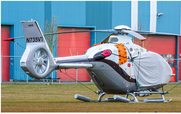
Airbus EC135T3 Blade Tie-Downs