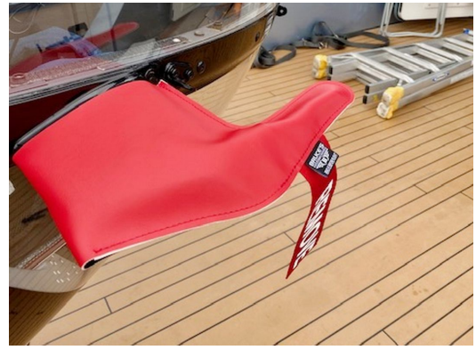
Airbus Helicopter H145 Pitot Tube Cover