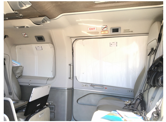
Eurocopter EC-145 Cabin Heatshields