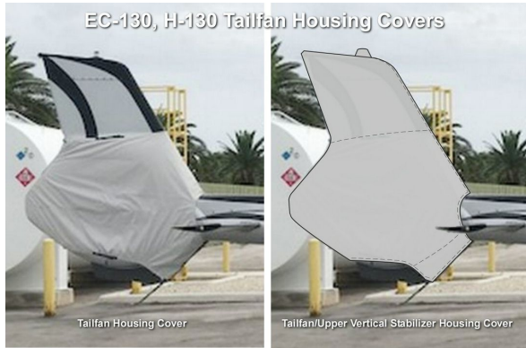
Airbus Helicopter H-130 Tailfan Housing Covers

The Tailboom Cover details vary by model, but generally the helicopter tail boom cover encloses the tail boom from the "bottleneck" to the aft end. They usually also cover the horizontal stabilizers, and are custom made to allow for antennae, lights, and other protrusions. They attach with straps underneath the tail boom. Covers for the vertical and horizontal stabilizers are also available separately. Specific information for each model is available on request.