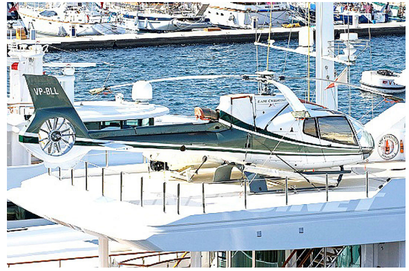
EC-130 Front, Side and Skylight Window HeatShields