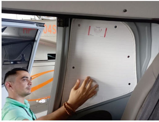
Airbus Helicopter EC130 B4 Side Window Heatshields