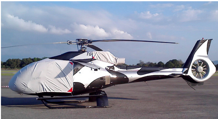
Bubble Cover and Intake/Exhaust Cover

The Engine Exhaust Plugs are custom fit for your Airbus Helicopter H-130 exhaust openings, made with heavy-duty vinyl material, and stuffed with a single block of sculpted urethane foam. Exhaust plugs have 'Remove Before Flight' streamers sewn onto the face of the plugs. Exhaust plugs may be inserted soon after flight when the engine is still warm. Engine Inlet Plugs are commonly referred to as Cowl Plugs, Intake Plugs, Cowl Blocks, Engine Blocks, and Engine Bungs.