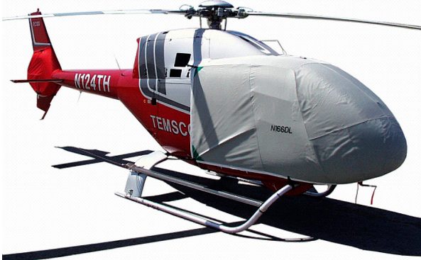
Eurocopter EC-120 Bubble Cover & Tailfan Cover

This cover type is made from Silver Acrylic Sunbrella canvas and is 100% lined with a soft and smooth microfiber. Bruce's Custom Covers developed this material combination especially for aircraft protection. The outer material is medium weight and treated for water resistance, UV resistance and anti-static buildup. The inner lining is a very soft and smooth microfiber to prevent scratching. The material is very reflective, and tests show that the cabin interior temperature can be reduced to near-ambient temperature on the hottest of days. It is water, ice and snow repellent, yet breathable to allow moisture to escape from between the cover and the aircraft surface.