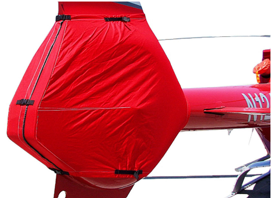
Eurocopter EC-120 Tailfan Cover