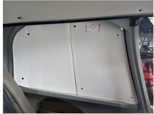
Airbus Helicopter H-130 Side Window Heatshields