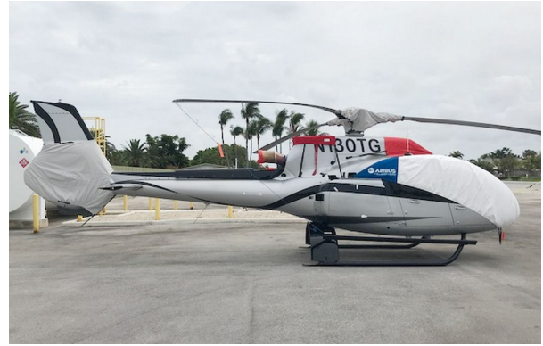
AIRBUS H130 T2, Intake, Exhaust & Tailfan Covers