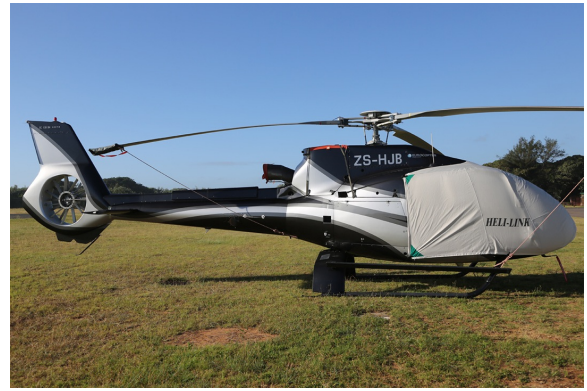
EC-130 Bubble Cover