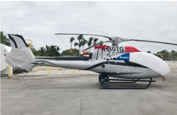
AIRBUS H130 T2, Intake, Exhaust & Tailfan Covers

The Tailboom Cover details vary by model, but generally the helicopter tail boom cover encloses the tail boom from the "bottleneck" to the aft end. They usually also cover the horizontal stabilizers, and are custom made to allow for antennae, lights, and other protrusions. They attach with straps underneath the tail boom. Covers for the vertical and horizontal stabilizers are also available separately. Specific information for each model is available on request.