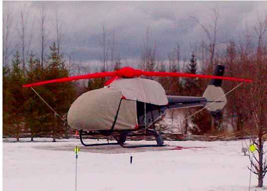
EC-130 Bubble, Engine, Rotor Hub, Blade & Tailfan Covers

The Tailboom Cover details vary by model, but generally the helicopter tail boom cover encloses the tail boom from the "bottleneck" to the aft end. They usually also cover the horizontal stabilizers, and are custom made to allow for antennae, lights, and other protrusions. They attach with straps underneath the tail boom. Covers for the vertical and horizontal stabilizers are also available separately. Specific information for each model is available on request.