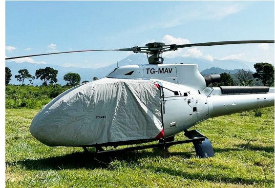
Airbus H-130 Insulated Bubble Cover