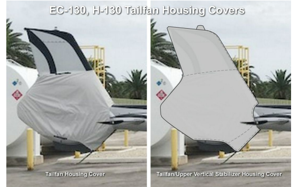
Airbus Helicopter H-130 Tailfan Housing Covers