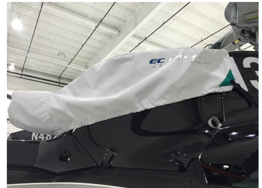
EC-130 Engine Area/Exhaust Cover