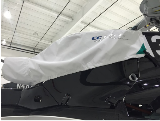
EC-130 Engine Area/Exhaust Cover

some air circulation and drainage in freezing weather. Some part numbers have features for an extra charge.