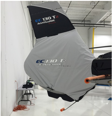
EC-130 Tailfan Cover