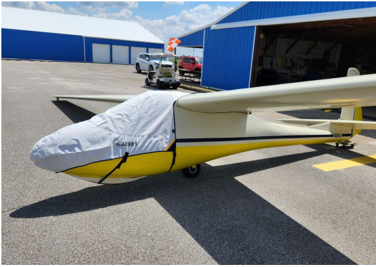
Aer-Pegaso M-100S Canopy/Nose Cover

the hottest of days. It is water, ice and snow repellent, yet breathable to allow moisture to escape from between the cover and the aircraft surface.