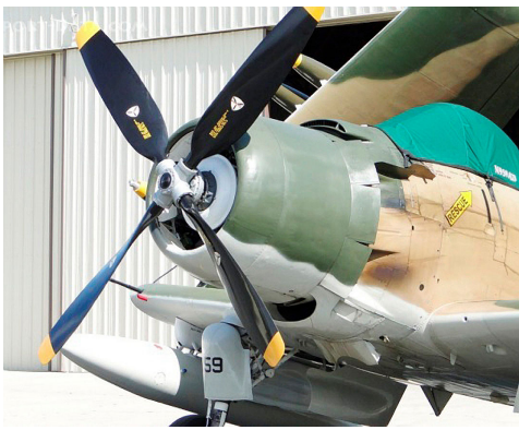
Douglas Skyraider Canopy Cover