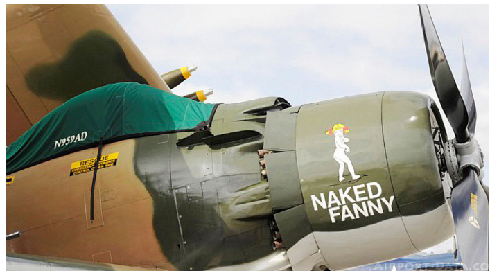
Douglas Skyraider Canopy Cover