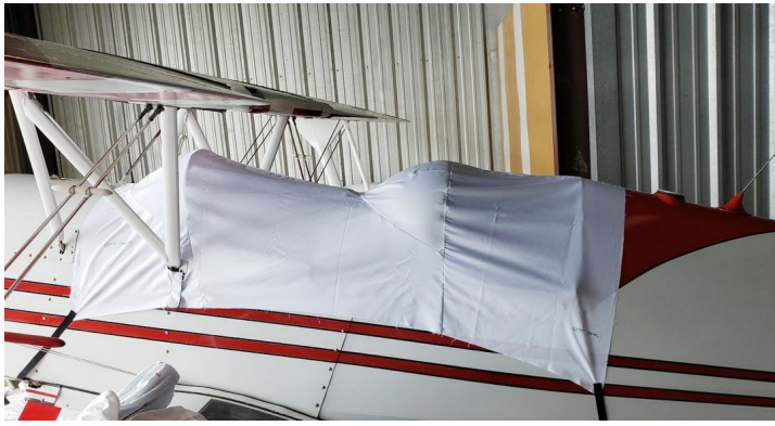
Acro Sport 2 Canopy Cover, test fit cover