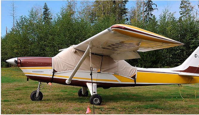
Lark Canopy Cover