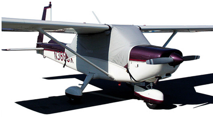
Lark Canopy Cover

the hottest of days. It is water, ice and snow repellent, yet breathable to allow moisture to escape from between the cover and the aircraft surface.