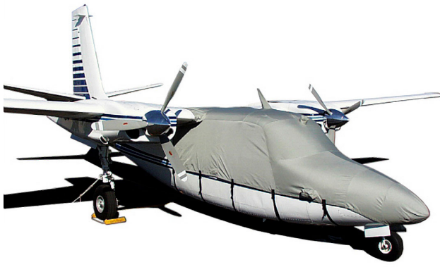
Aero Commander 500S Canopy/Nose Cover