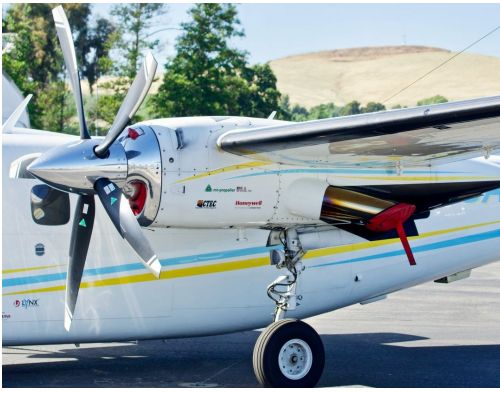
Aero Commander 690B Engine Inlet & Exhaust Plugs