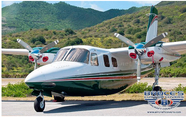
Aero Commander 500 Engine Inlet Plugs