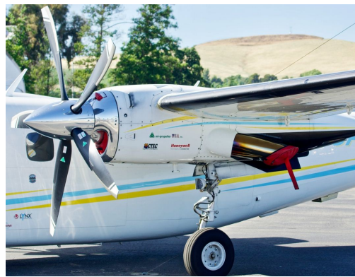
Aero Commander 690B Engine Inlet & Exhaust Plugs