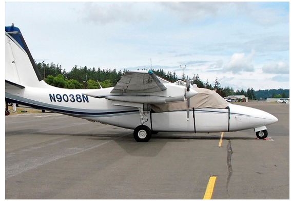
Aero Commander 500 Canopy Cover