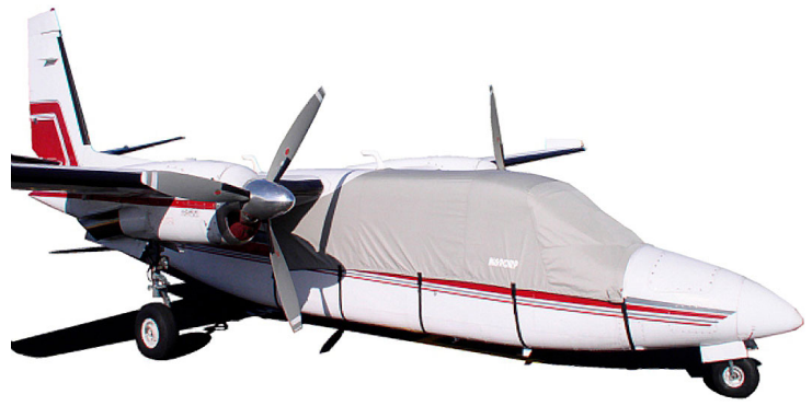
Aero Commander 690b Canopy Cover