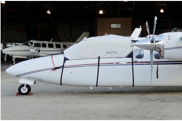
Rockwell Aero Commander 685, 690 & 840 Cockpit Cover