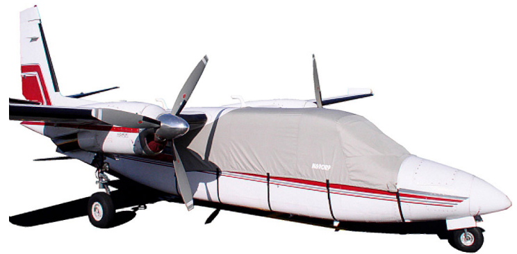
Aero Commander 690b Canopy Cover