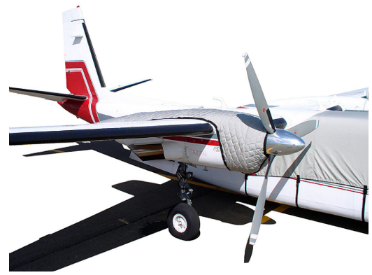
Aero Commander Insulated Engine Cover