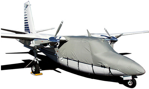
Aero Commander 500S Canopy/Nose Cover

Travel Covers are made with Silver Solution-Dyed Polyester fabric and only lined over the windshield to save weight. The material is lightweight and more compact for easy stowage in the aircraft. The polyester material is water resistant, but only intended for occasional use outside. We also have an ultra lightweight material available for fitted hangar dust covers. For daily outdoor use, the non-travel Sunbrella Cover is the best choice.