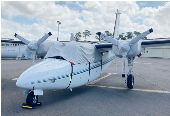
Aero Commander 500S Shrike Canopy, Engine & Prop Covers