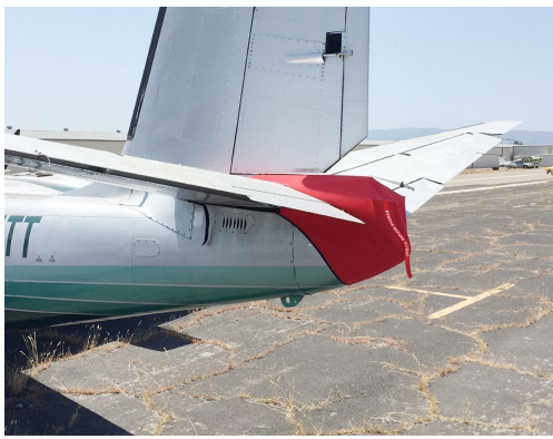
Rockwell Aero Commander Tailcone Cover