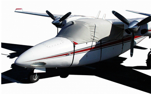
Aero Commander 680 Canopy Cover

Travel Covers are made with Silver Solution-Dyed Polyester fabric and only lined over the windshield to save weight. The material is lightweight and more compact for easy stowage in the aircraft. The polyester material is water resistant, but only intended for occasional use outside. We also have an ultra lightweight material available for fitted hangar dust covers. For daily outdoor use, the non-travel Sunbrella Cover is the best choice.