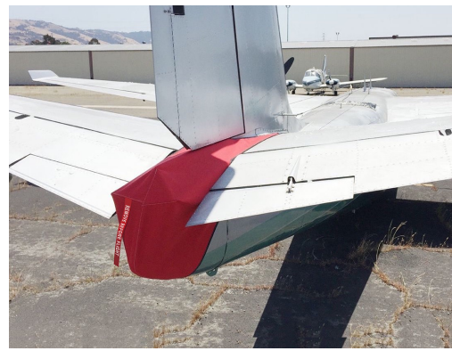
Rockwell Aero Commander Tailcone Cover