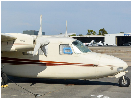
Aero Commander AC500 Ptopellor/Spinner Covers

This cover type is made from Silver Acrylic Sunbrella canvas and is 100% lined with a soft and smooth microfiber. Bruce's Custom Covers developed this material combination especially for aircraft protection. The outer material is medium weight and treated for water resistance, UV resistance and anti-static buildup. The inner lining is a very soft and smooth microfiber to prevent scratching. The material is very reflective, and tests show that the cabin interior temperature can be reduced to near-ambient temperature on the hottest of days. It is water, ice and snow repellent, yet breathable to allow moisture to escape from between the cover and the aircraft surface.