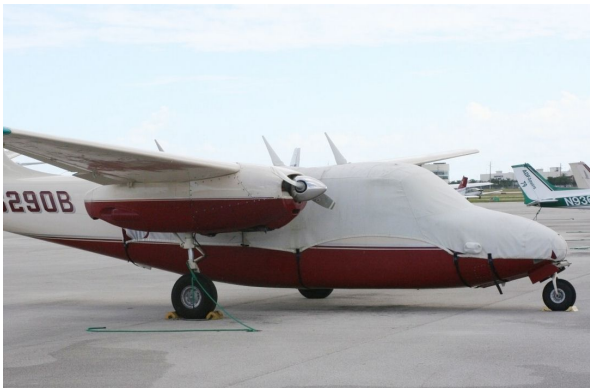
Aero Commander 500 Canopy/Nose Cover Over The Type

This cover type is made from Silver Acrylic Sunbrella canvas and is 100% lined with a soft and smooth microfiber. Bruce's Custom Covers developed this material combination especially for aircraft protection. The outer material is medium weight and treated for water resistance, UV resistance and anti-static buildup. The inner lining is a very soft and smooth microfiber to prevent scratching. The material is very reflective, and tests show that the cabin interior temperature can be reduced to near-ambient temperature on the hottest of days. It is water, ice and snow repellent, yet breathable to allow moisture to escape from between the cover and the aircraft surface.