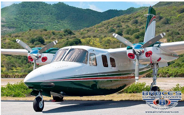
Aero Commander 500 Engine Inlet Plugs

Engine Inlet Plugs are custom fit for your Rockwell Commander 500, 520, 560, Short 680 intakes, made with heavy-duty vinyl material, and stuffed with a single block of sculpted urethane foam. Each plug has a zipper that allows the foam to be removed and dried if necessary. Engine plugs have warning flags that are visible from the cockpit or 'remove before flight' streamers sewn onto the face of the plugs. Most plugs are imprinted with the aircraft registration number in black for an extra charge. Storage bag NOT included. Engine plugs may be inserted after flight when the engine is still warm. Engine Inlet Plugs are commonly referred to as Cowl Plugs, Intake Plugs, Cowl Blocks, Engine Blocks, and Engine Bungs.