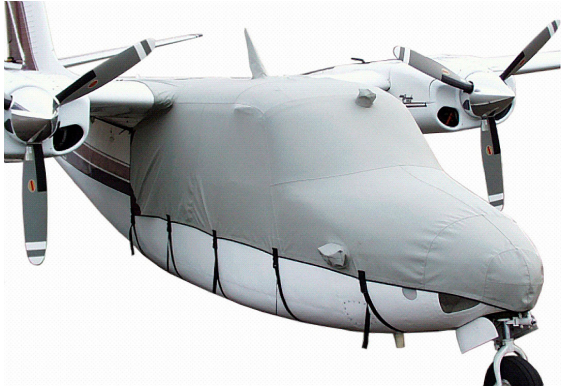
Canopy/Nose Cover (extends over top past leading edge)