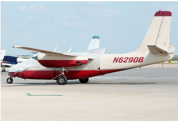
Aero Commander 500 Canopy/Nose Cover, Over-Top Type