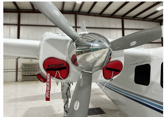
Aero Commander 500B Engine Intake Plugs