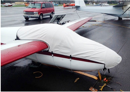
SGS 1-26B Canopy/Nose Cover