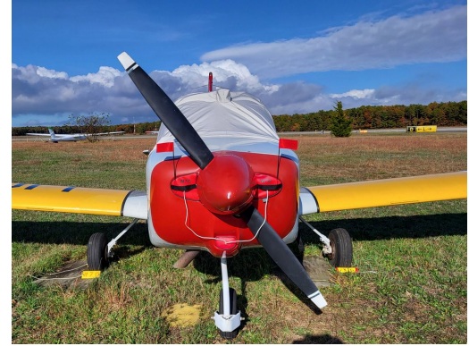
Grumman AA-1A Lynx Engine Inlet Plugs