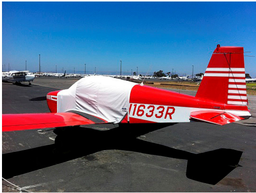
Grumman AA1 Extended Canopy Cover

This cover type is made from Silver Acrylic Sunbrella canvas and is 100% lined with a soft and smooth microfiber. Bruce's Custom Covers developed this material combination especially for aircraft protection. The outer material is medium weight and treated for water resistance, UV resistance and anti-static buildup. The inner lining is a very soft and smooth microfiber to prevent scratching. The material is very reflective, and tests show that the cabin interior temperature can be reduced to near-ambient temperature on the hottest of days. It is water, ice and snow repellent, yet breathable to allow moisture to escape from between the cover and the aircraft surface.