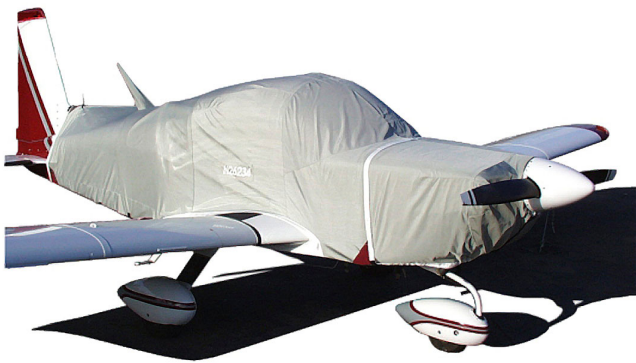
Grumman AA-5 Extended Canopy Cover & Engine Cover

This cover type is made from Silver Acrylic Sunbrella canvas and is 100% lined with a soft and smooth microfiber. Bruce's Custom Covers developed this material combination especially for aircraft protection. The outer material is medium weight and treated for water resistance, UV resistance and anti-static buildup. The inner lining is a very soft and smooth microfiber to prevent scratching. The material is very reflective, and tests show that the cabin interior temperature can be reduced to near-ambient temperature on the hottest of days. It is water, ice and snow repellent, yet breathable to allow moisture to escape from between the cover and the aircraft surface.