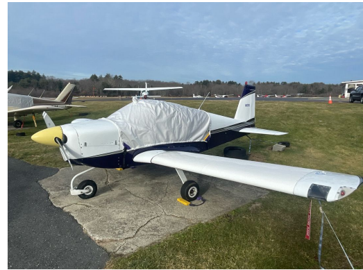
Grumman AA-1A Canopy Cover