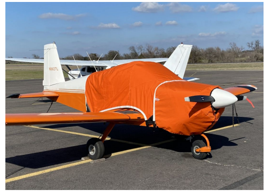
AA-1 Extended Canopy & Fully Enclosed Engine Cover