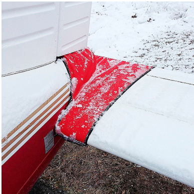
Piper PA-28 Tailcone Cover

WINTER USE MATERIAL - Made with Solution-Dyed Polyester fabric, this option is intended for seasonal use to aid in deicing, rain mitigation, or for occasional travel. The material is lighter and more compact, but more susceptible to UV damage and may have a shorter useful life if used continuously outside than the all-year use material.