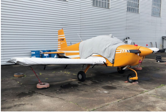
Grumman AA1B Yankee Wing Covers & Engine Inlet Plugs

and dried if necessary. Engine plugs have warning flags that are visible from the cockpit or 'remove before flight' streamers sewn onto the face of the plugs. Most plugs are imprinted with the aircraft registration number in black for an extra charge. Storage bag NOT included. Engine plugs may be inserted after flight when the engine is still warm. Engine Inlet Plugs are commonly referred to as Cowl Plugs, Intake Plugs, Cowl Blocks, Engine Blocks, and Engine Bungs.