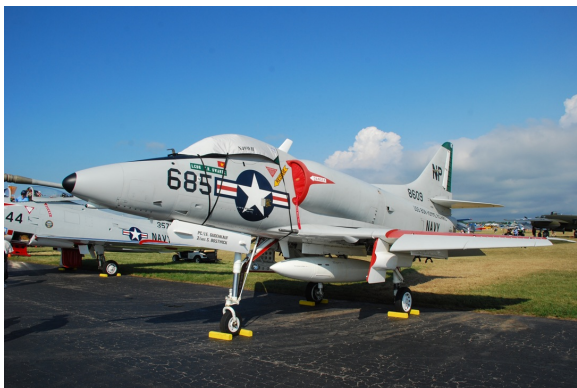
A-4 Skyhawk Canopy Cover

This cover type is made from Silver Acrylic Sunbrella canvas and is 100% lined with a soft and smooth microfiber. Bruce's Custom Covers developed this material combination especially for aircraft protection. The outer material is medium weight and treated for water resistance, UV resistance and anti-static buildup. The inner lining is a very soft and smooth microfiber to prevent scratching. The material is very reflective, and tests show that the cabin interior temperature can be reduced to near-ambient temperature on the hottest of days. It is water, ice and snow repellent, yet breathable to allow moisture to escape from between the cover and the aircraft surface.