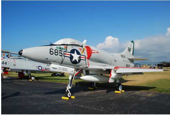
A-4 Skyhawk Canopy Cover

Travel Covers are made with Silver Solution-Dyed Polyester fabric and only lined over the windshield to save weight. The material is lightweight and more compact for easy stowage in the aircraft. The polyester material is water resistant, but only intended for occasional use outside. We also have an ultra lightweight material available for fitted hangar dust covers. For daily outdoor use, the non-travel Sunbrella Cover is the best choice.