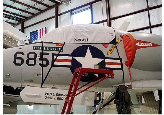
A-4 Skyhawk Canopy Cover