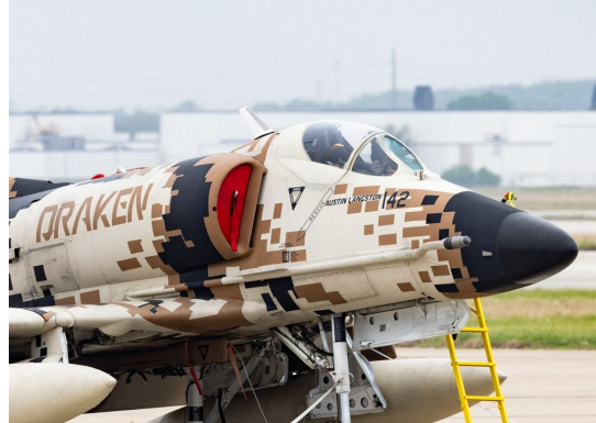
McDonnell Douglas A4 Skyhawk Engine Intake Plugs