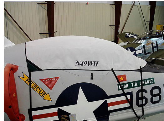
A-4 Skyhawk Canopy Cover