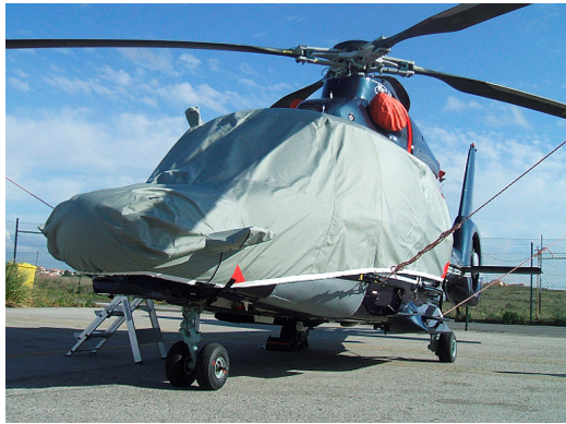
Dauphin Bubble Cover, extended nose

Travel Covers are made with Silver Solution-Dyed Polyester fabric and fully lined over the entire cover. The material is lightweight and more compact for easy storage in the aircraft. The polyester material is water resistant, but only intended for occasional use outside. We also have an ultra lightweight material available for fitted hangar dust covers. For daily outdoor use, the non-travel Sunbrella Cover is the best choice.