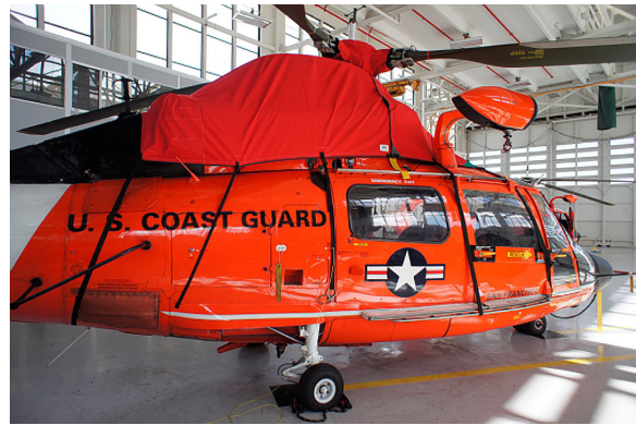
MH-65C Engine Area, Rotor Hub, Swash Plate Aperture Cover set, P/N: A365-210