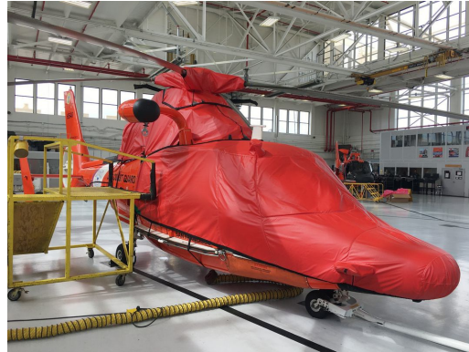
U.S. Coast Guard HH-65 Dolphin Bubble, Engine & Rotor Mast Covers