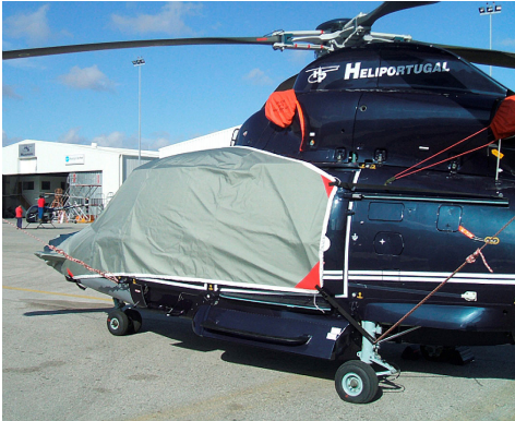
Dauphin Bubble Cover, extended nose

This cover type is made from Silver Acrylic Sunbrella canvas and is 100% lined with a soft and smooth microfiber. Bruce's Custom Covers developed this material combination especially for aircraft protection. The outer material is medium weight and treated for water resistance, UV resistance and anti-static buildup. The inner lining is a very soft and smooth microfiber to prevent scratching. The material is very reflective, and tests show that the cabin interior temperature can be reduced to near-ambient temperature on the hottest of days. It is water, ice and snow repellent, yet breathable to allow moisture to escape from between the cover and the aircraft surface.