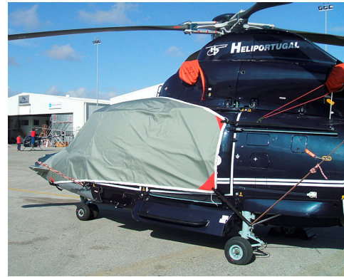
Dauphin Bubble Cover, extended nose