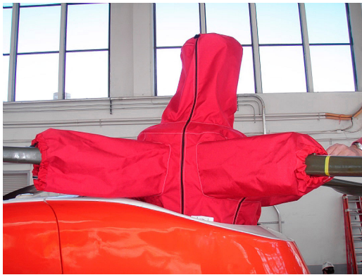
MH-65C Rotor Hub Cover w/ OADS Tube Cover detail

Insulated Covers Material - A special composite material of solution-dyed polyester, 3M Thinsulate insulation, and soft nylon interior fabric. Our insulated covers are designed to complement an engine preheater and help retain heat in the engine compartment after shutdown. If you operate your aircraft in cold-weather, these covers will help prevent engine wear and tear.