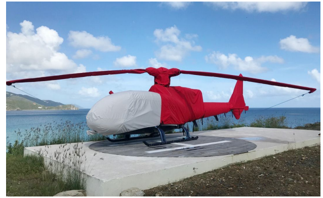
Aerospatiale AS341/342 Gazelle Full Cover Set