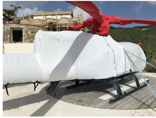
Aerospatiale AS341/342 Gazelle Full Cover Set Aerospatiale Gazelle AS341 Bubble, Rotor Mast, Blade, Engine & Tailboom Covers (some are test fit covers)