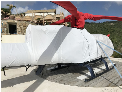
Aerospatiale Gazelle AS341 Bubble, Rotor Mast, Blade, Engine & Tailboom Covers (some are test fit covers)