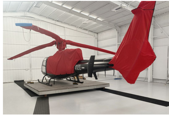
Aerospatiale Gazelle Engine, Rotor Hub, Blades & Tailfan Covers