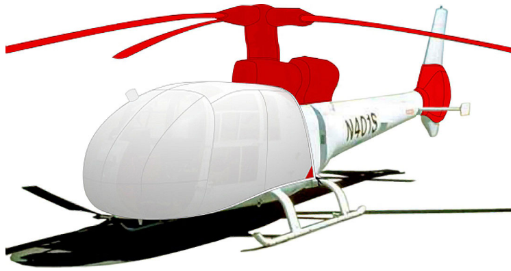
Gazelle Bubble, Abbr. Engine, Rotor Hub, Blades & Fenstron Covers (Illustration)