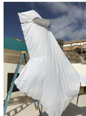
Aerospatiale Gazelle AS341 Tailfan Housing Extended Cover (test fit cover)