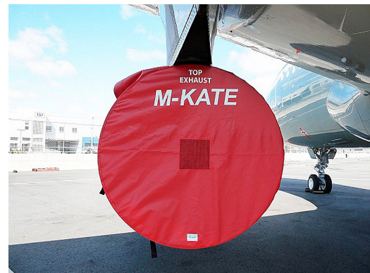
Airbus A319 Intake/Exhaust Covers set, IAE V2500