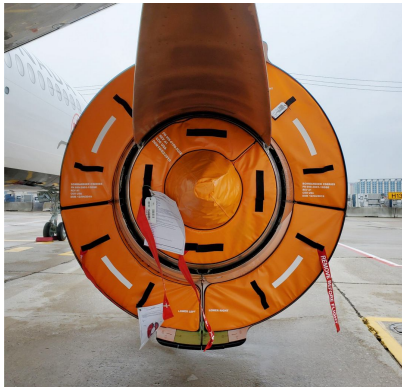
Airbus A320 Exhaust & Bypass Vent Plugs

The Engine Inlet Plugs are custom fit for your Airbus A340 intakes, made with heavy-duty vinyl material, and stuffed with a single block of sculpted urethane foam. Each plug has a zipper that allows the foam to be removed and dried if necessary. Engine plugs have 'remove before flight' streamers sewn onto the face of the plugs. Most plugs are imprinted with the aircraft registration number in black for an extra charge. Storage bag NOT included. Engine plugs may be inserted after flight when the engine is still warm. Engine Inlet Plugs are commonly referred to as Cowl Plugs, Intake Plugs, Cowl Blocks, Engine Blocks, and Engine Bungs.