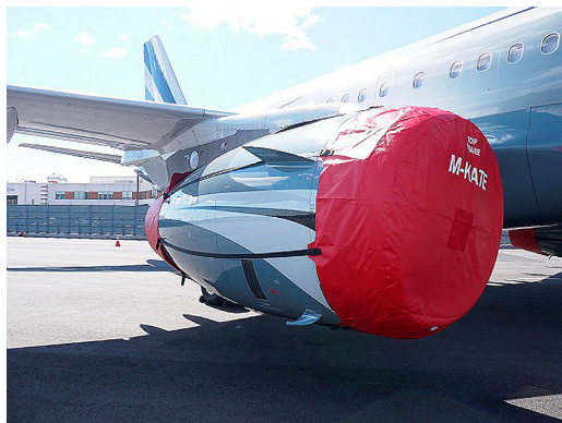
Airbus A319 Intake/Exhaust Covers set, IAE V2500