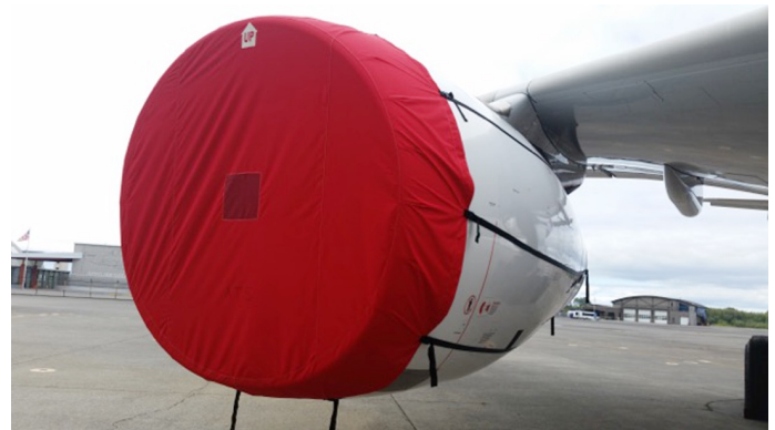
Airbus A330 Intake Cover, Trent 700 Engine