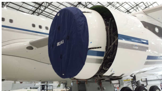
Airbus 340 Intake Covers