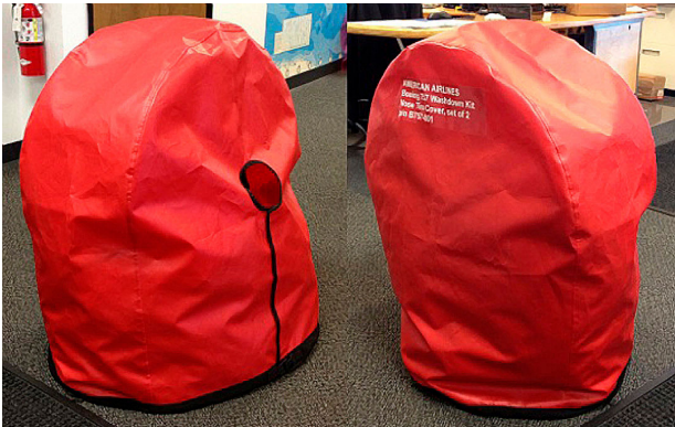
Boeing 757 Tire Covers, great for Wash Prep or Storage