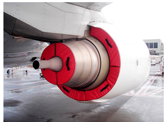
Boeing 737 NG Exhaust Plug Set, Folding Donut Ring Type