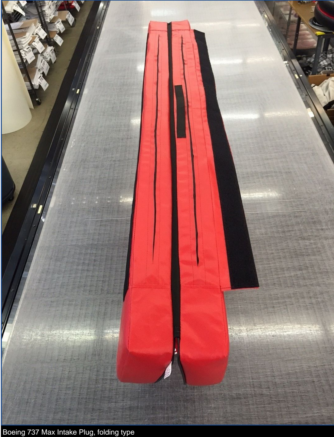
Boeing 737 Max Intake Plug, folding type