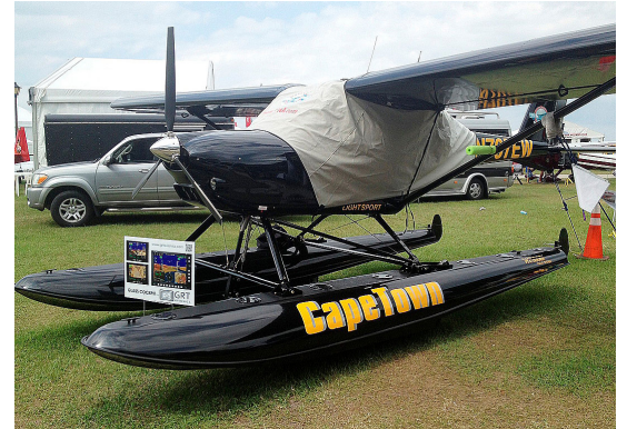
A-22 Over-the-Top Canopy Cover