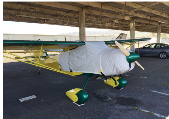
Kitfox Canopy & Engine Covers