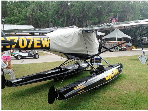
A-22 Over-the-Top Canopy Cover

occasional use outside. We also have an ultra lightweight material available for fitted hangar dust covers. For daily outdoor use, the non-travel Sunbrella Cover is the best choice.