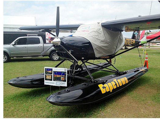
A-22 Over-the-Top Canopy Cover