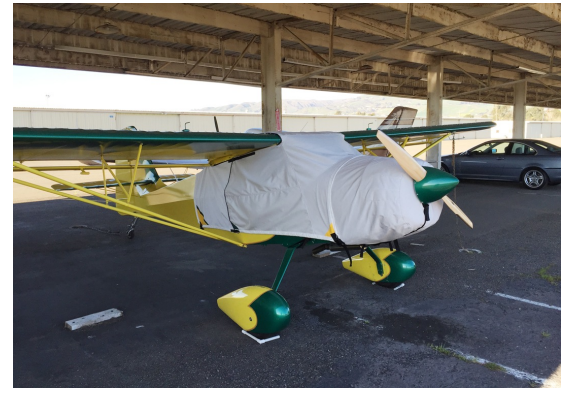
Kitfox Canopy & Engine Covers