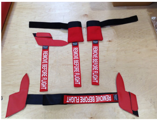
Airbus A319 Pitot & Tat Covers, Heat Resistant Type