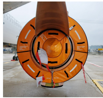
Airbus A320 Exhaust & Bypass Vent Plugs