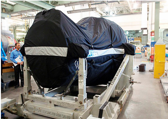
QEC OFF-LINK JET ENGINE COVER, V2500 Series, fully enclosed

ALL-YEAR USE MATERIAL - Made with Solution dyed Polyester fabric, the all-year use material is the best option for sun protection and cover longevity. This heavier more durable material is intended for all weather conditions, such as rain and snow or lots of sun.