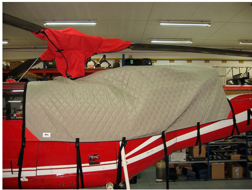
Alouette III Rotor Hub Cover, Insulated Engine/Transmission Cover

WINTER USE MATERIAL - Made with Solution-Dyed Polyester fabric, this option is intended for seasonal use to aid in deicing, rain mitigation, or for occasional travel. The material is lighter and more compact, but more susceptible to UV damage and may have a shorter useful life if used continuously outside than the all-year use material.