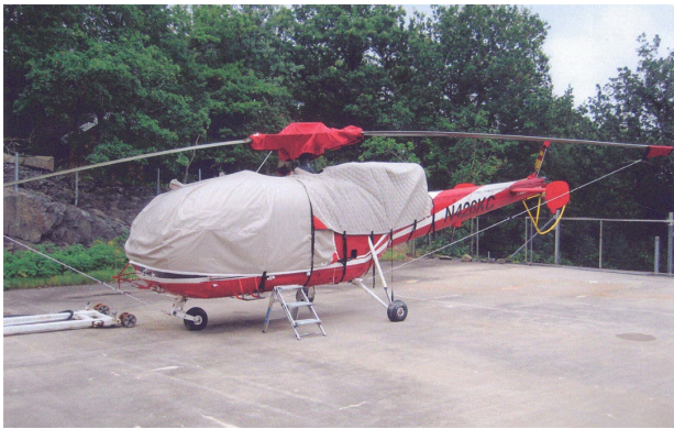
Alouette III Bubble, Rotor Hub & Engine Covers, Blade Tie-Downs