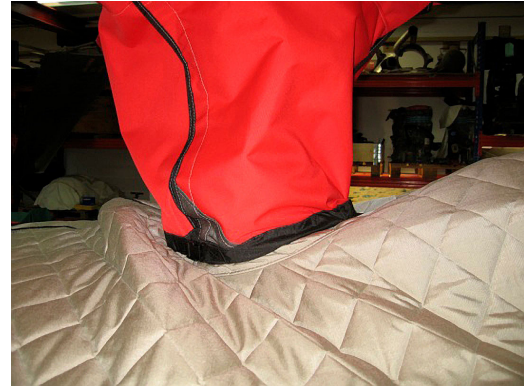
Alouette III Rotor Hub Cover, Insulated Engine/Transmission Cover Alouette III Rotor Hub Cover & Engine/Transmission Cover