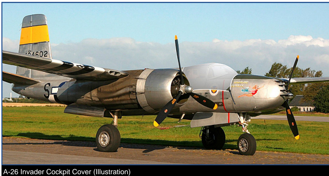
A-26 Invader Cockpit Cover (Illustration)