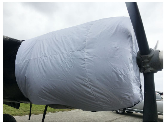
Douglas A-26 Engine Cover, test fit cover