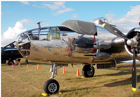
Mitchell B25 Cockpit Cover (Snap-On Type)

Engine Inlet Plugs are custom fit for your Douglas A26 Invader intakes, made with heavy-duty vinyl material, and stuffed with a single block of sculpted urethane foam. Each plug has a zipper that allows the foam to be removed and dried if necessary. Engine plugs have warning flags that are visible from the cockpit or 'remove before flight' streamers sewn onto the face of the plugs. Most plugs are imprinted with the aircraft registration number in black for an extra charge. Storage bag NOT included. Engine plugs may be inserted after flight when the engine is still warm. Engine Inlet Plugs are commonly referred to as Cowl Plugs, Intake Plugs, Cowl Blocks, Engine Blocks, and Engine Bungs.