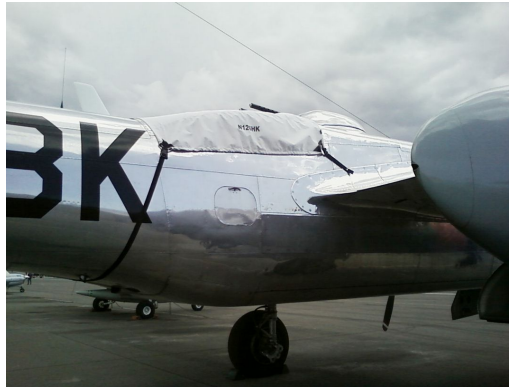
Douglas A-26C Gunner's Area Cover