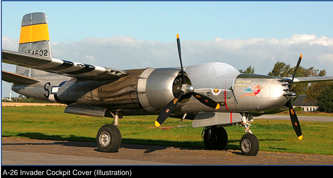
A-26 Invader Cockpit Cover (Illustration)