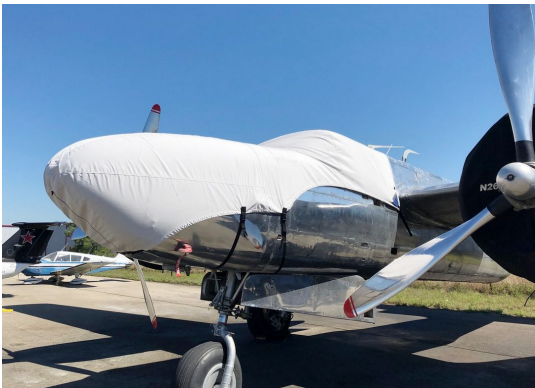
Douglas A26 Invader Cockpit/Nose Cover