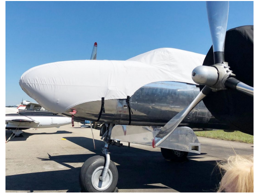
Douglas A26 Invader Cockpit/Nose Cover