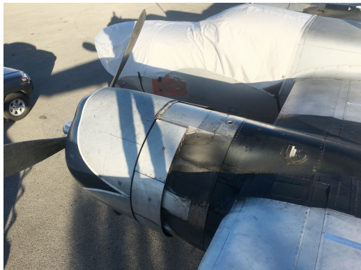
Douglas A-26 Cockpit/Nose Cover

the hottest of days. It is water, ice and snow repellent, yet breathable to allow moisture to escape from between the cover and the aircraft surface.