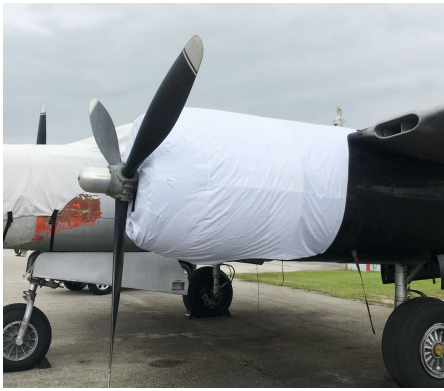
Douglas A-26 Engine Cover, test fit cover