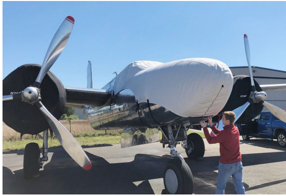
Douglas A26 Invader Cockpit/Nose Cover

the hottest of days. It is water, ice and snow repellent, yet breathable to allow moisture to escape from between the cover and the aircraft surface.