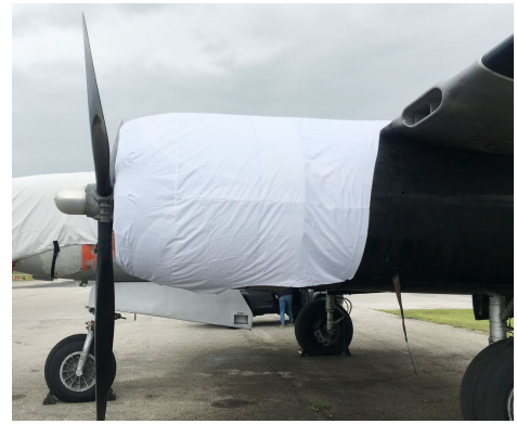
Douglas A-26 Engine Cover, test fit cover