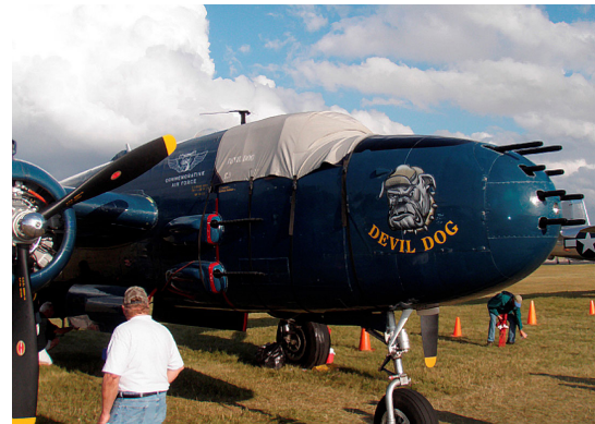
Mitchell B25 Cockpit Cover w/ Custom Imprint (Bellystrap Type)