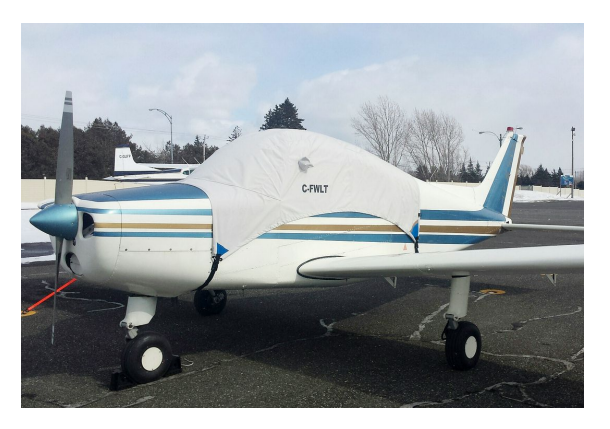
Beechcraft A23 Muskateer