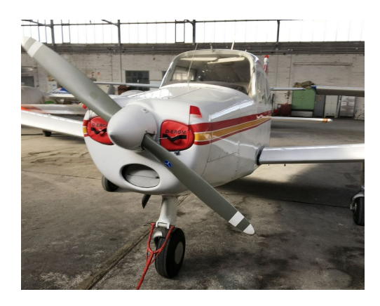
Beech Musketeer Engine Inlet Plugs

Engine Inlet Plugs are custom fit for your Beech Musketeer A23 intakes, made with heavy-duty vinyl material, and stuffed with a single block of sculpted urethane foam. Each plug has a zipper that allows the foam to be removed and dried if necessary. Engine plugs have warning flags that are visible from the cockpit or 'remove before flight' streamers sewn onto the face of the plugs. Most plugs are imprinted with the aircraft registration number in black for an extra charge. Storage bag NOT included. Engine plugs may be inserted after flight when the engine is still warm. Engine Inlet Plugs are commonly referred to as Cowl Plugs, Intake Plugs, Cowl Blocks, Engine Blocks, and Engine Bungs.