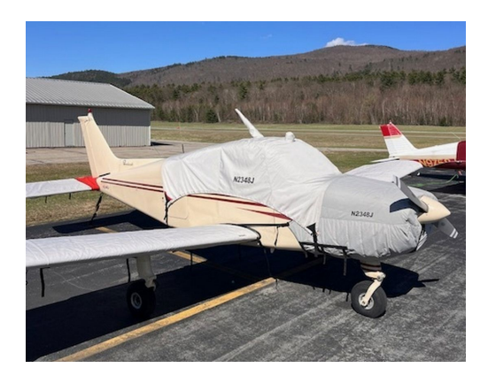
Beech A23 Musketeer Canopy, Insulated Engine, Wing Covers

This cover type is made from Silver Acrylic Sunbrella canvas and is 100% lined with a soft and smooth microfiber. Bruce's Custom Covers developed this material combination especially for aircraft protection. The outer material is medium weight and treated for water resistance, UV resistance and anti-static buildup. The inner lining is a very soft and smooth microfiber to prevent scratching. The material is very reflective, and tests show that the cabin interior temperature can be reduced to near-ambient temperature on the hottest of days. It is water, ice and snow repellent, yet breathable to allow moisture to escape from between the cover and the aircraft surface.