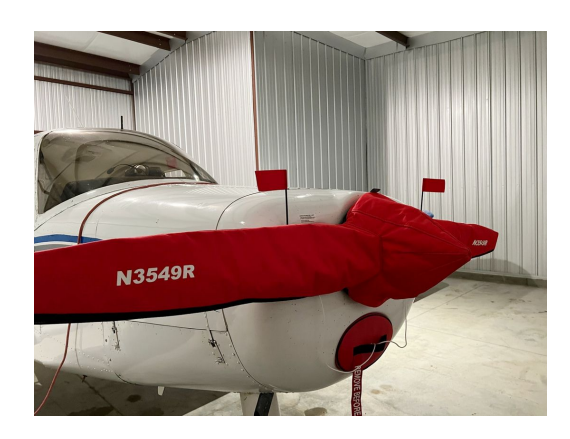
Beech A23 Musketeer Insulated Prop Cover, Engine Plugs