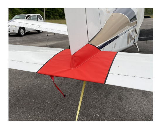
Beech C23 Tailcone Cover, Fully Enclosed

WINTER USE MATERIAL - Made with Solution-Dyed Polyester fabric, this option is intended for seasonal use to aid in deicing, rain mitigation, or for occasional travel. The material is lighter and more compact, but more susceptible to UV damage and may have a shorter useful life if used continuously outside than the all-year use material.