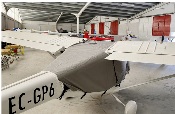
Aeroprakt A22 Over-Top Canopy Cover

Travel Covers are made with Silver Solution-Dyed Polyester fabric and only lined over the windshield to save weight. The material is lightweight and more compact for easy stowage in the aircraft. The polyester material is water resistant, but only intended for occasional use outside. We also have an ultra lightweight material available for fitted hangar dust covers. For daily outdoor use, the non-travel Sunbrella Cover is the best choice.