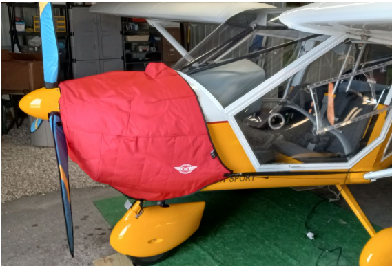
Aeroprakt A-22 Insulated Engine Cover

Insulated Covers Material - A special composite material of solution-dyed polyester, 3M Thinsulate insulation, and soft nylon interior fabric. Our insulated covers are designed to complement an engine preheater and help retain heat in the engine compartment after shutdown. If you operate your aircraft in cold-weather, these covers will help prevent engine wear and tear.