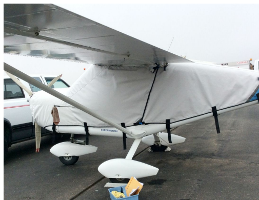
Aeroprakt A-22 Valor Canopy/Engine Cover

This cover type is made from Silver Acrylic Sunbrella canvas and is 100% lined with a soft and smooth microfiber. Bruce's Custom Covers developed this material combination especially for aircraft protection. The outer material is medium weight and treated for water resistance, UV resistance and anti-static buildup. The inner lining is a very soft and smooth microfiber to prevent scratching. The material is very reflective, and tests show that the cabin interior temperature can be reduced to near-ambient temperature on the hottest of days. It is water, ice and snow repellent, yet breathable to allow moisture to escape from between the cover and the aircraft surface.