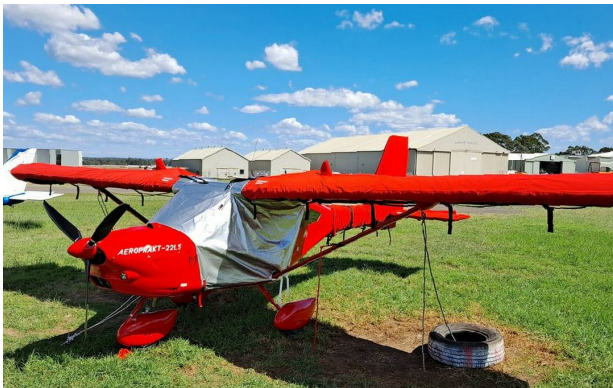
Aeroprakt A22 Wing & Empennage Covers

WINTER USE MATERIAL - Made with Solution-Dyed Polyester fabric, this option is intended for seasonal use to aid in deicing, rain mitigation, or for occasional travel. The material is lighter and more compact, but more susceptible to UV damage and may have a shorter useful life if used continuously outside than the all-year use material.