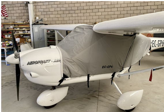
Aeroprakt A22 Over-Top Canopy Cover

Travel Covers are made with Silver Solution-Dyed Polyester fabric and only lined over the windshield to save weight. The material is lightweight and more compact for easy stowage in the aircraft. The polyester material is water resistant, but only intended for occasional use outside. We also have an ultra lightweight material available for fitted hangar dust covers. For daily outdoor use, the non-travel Sunbrella Cover is the best choice.