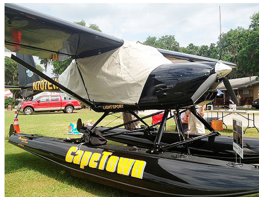
A-22 Over-the-Top Canopy Cover