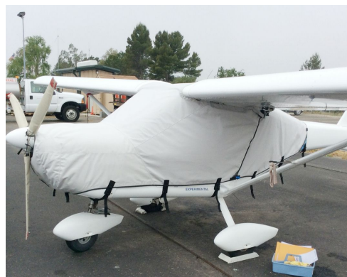
Aeroprakt A-22 Valor Canopy/Engine Cover