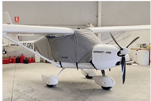
Aeroprakt A22 Over-Top Canopy Cover