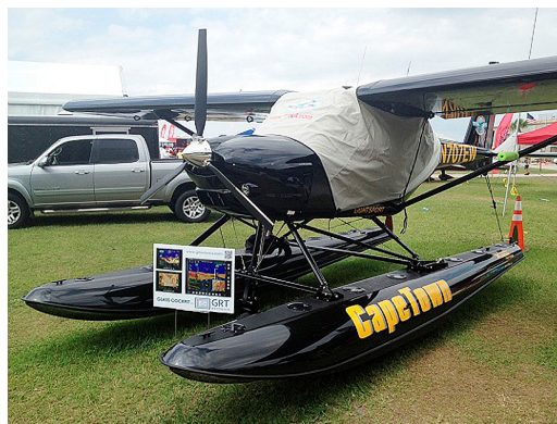
A-22 Over-the-Top Canopy Cover