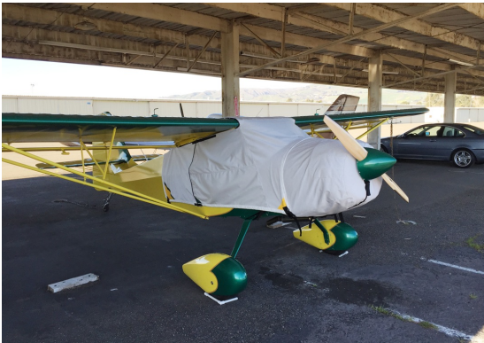
Kitfox Canopy & Engine Covers

Insulated Covers Material - A special composite material of solution-dyed polyester, 3M Thinsulate insulation, and soft nylon interior fabric. Our insulated covers are designed to complement an engine preheater and help retain heat in the engine compartment after shutdown. If you operate your aircraft in cold-weather, these covers will help prevent engine wear and tear.