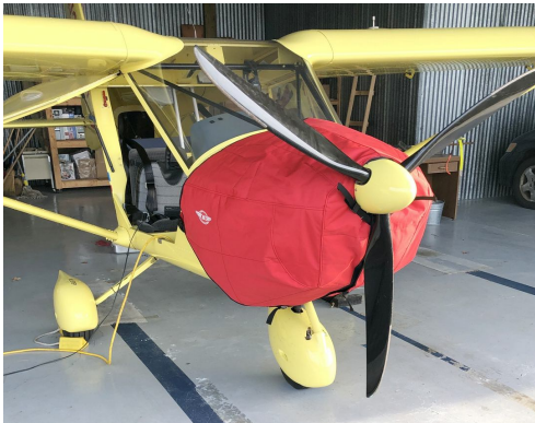
Aeroprakt A-22 Valor Insulated Engine Cover