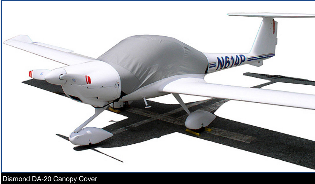
Diamond DA-20 Canopy Cover