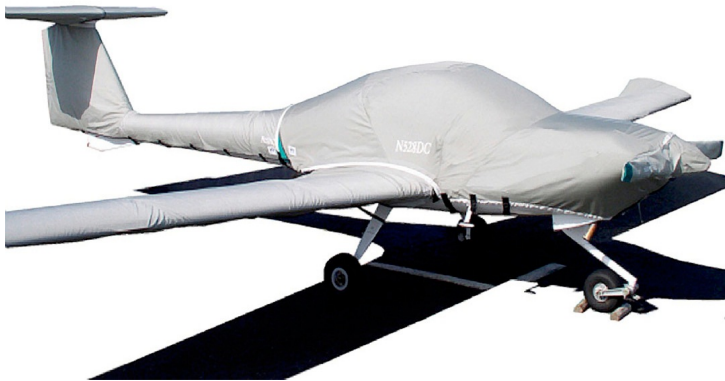
Diamond DA-20 Full Cover Set

This cover type is made from Silver Acrylic Sunbrella canvas and is 100% lined with a soft and smooth microfiber. Bruce's Custom Covers developed this material combination especially for aircraft protection. The outer material is medium weight and treated for water resistance, UV resistance and anti-static buildup. The inner lining is a very soft and smooth microfiber to prevent scratching. The material is very reflective, and tests show that the cabin interior temperature can be reduced to near-ambient temperature on the hottest of days. It is water, ice and snow repellent, yet breathable to allow moisture to escape from between the cover and the aircraft surface.