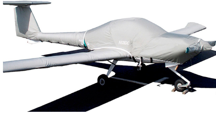
Diamond DA-20 Full Cover Set

WINTER USE MATERIAL - Made with Solution-Dyed Polyester fabric, this option is intended for seasonal use to aid in deicing, rain mitigation, or for occasional travel. The material is lighter and more compact, but more susceptible to UV damage and may have a shorter useful life if used continuously outside than the all-year use material.