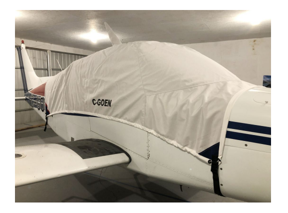
Beech Sierra B24R Canopy Cover

This cover type is made from Silver Acrylic Sunbrella canvas and is 100% lined with a soft and smooth microfiber. Bruce's Custom Covers developed this material combination especially for aircraft protection. The outer material is medium weight and treated for water resistance, UV resistance and anti-static buildup. The inner lining is a very soft and smooth microfiber to prevent scratching. The material is very reflective, and tests show that the cabin interior temperature can be reduced to near-ambient temperature on the hottest of days. It is water, ice and snow repellent, yet breathable to allow moisture to escape from between the cover and the aircraft surface.