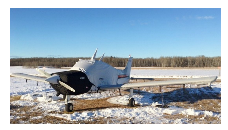
Beech Sport Insulated Engine Cover & Winter Cover Set

WINTER USE MATERIAL - Made with Solution-Dyed Polyester fabric, this option is intended for seasonal use to aid in deicing, rain mitigation, or for occasional travel. The material is lighter and more compact, but more susceptible to UV damage and may have a shorter useful life if used continuously outside than the all-year use material.