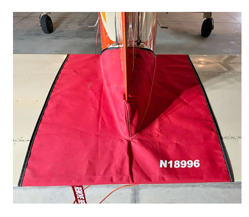
Beech C24R Tailcone Cover, fully enclosed