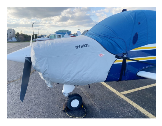
Beech C23 Sundowner Insulated Engine Cover