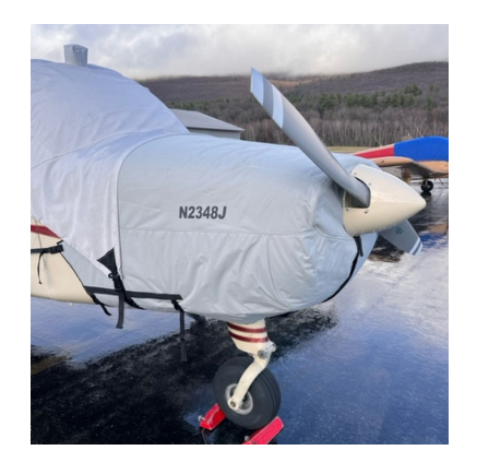
Beech Musketeer Insulated Engine Cover

This cover type is made from Silver Acrylic Sunbrella canvas and is 100% lined with a soft and smooth microfiber. Bruce's Custom Covers developed this material combination especially for aircraft protection. The outer material is medium weight and treated for water resistance, UV resistance and anti-static buildup. The inner lining is a very soft and smooth microfiber to prevent scratching. The material is very reflective, and tests show that the cabin interior temperature can be reduced to near-ambient temperature on the hottest of days. It is water, ice and snow repellent, yet breathable to allow moisture to escape from between the cover and the aircraft surface.