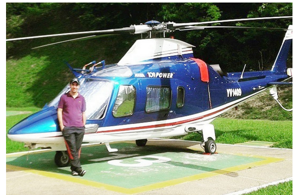
Agusta Power Cockpit & Cabin HeatShields