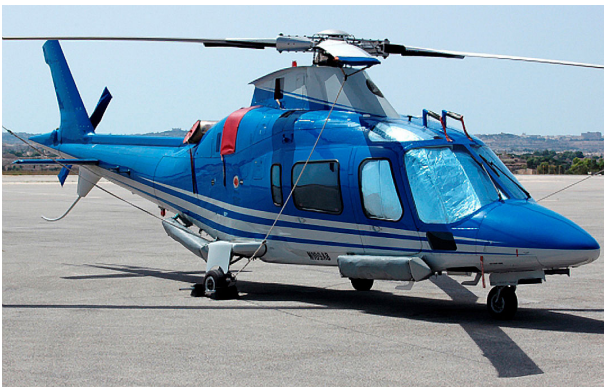
Agusta Power Cockpit HeatShields & Blade Tie-downs

Cockpit Heatshields are interior sunshades for the aircraft's cockpit. The product is a unique composite of closed-cell foam with a silver mylar finish. The semi-rigid design is stiff enough to stand inside the window framing. Darts and folds are incorporated into the material so that it conforms to the complex shape of the helicopter windows. The set folds up flat and is easily stored in the included storage sleeve. Some designs may require velcro and suction cups. A Heatshield is an excellent short-term remedy for cockpit overheating, but an external fabric cover is more effective for long-term protection.