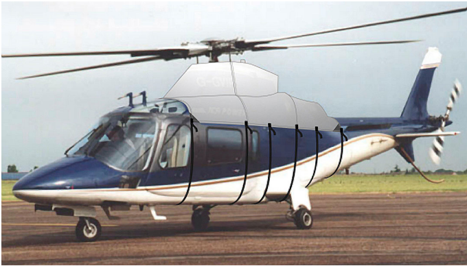
Agusta Power Engine Cover (illustration)