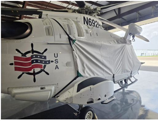
Agusta AW169 Bubble Cover