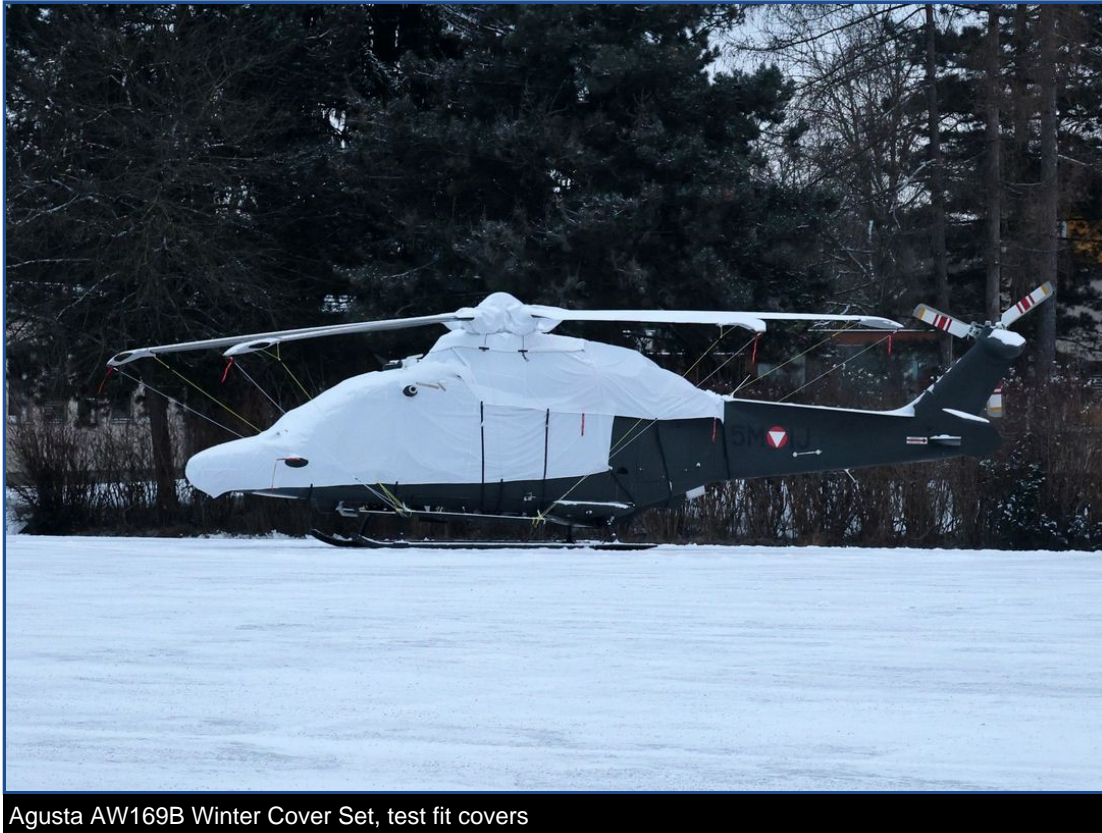
Agusta AW169B Winter Cover Set, test fit covers