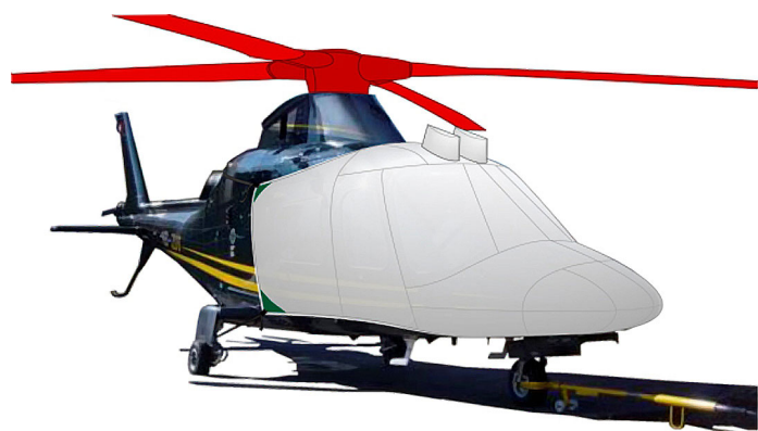
Agusta 109 Bubble, Rotor Hub & Blade Covers (illustration)

WINTER USE MATERIAL - Made with Solution-Dyed Polyester fabric, this option is intended for seasonal use to aid in deicing, rain mitigation, or for occasional travel. The material is lighter and more compact, but more susceptible to UV damage and may have a shorter useful life if used continuously outside than the all-year use material.