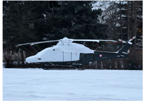
Agusta AW169B Winter Cover Set, test fit covers